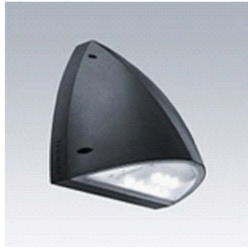
REFERENCE K LUMINAIRE - EXTERNAL LED BULKHEAD LUMINAIRE INCORPORATING PHOTOCELL CONTROL AND EMERGENCY LIGHTING