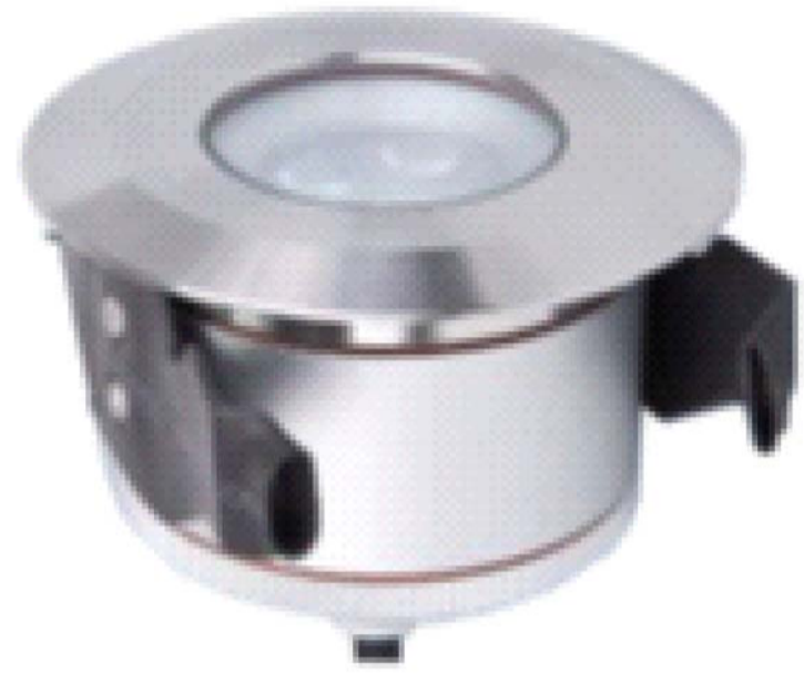
REFERENCE L LUMINAIRE - EXTERNAL FLOOR MOUNTED LED SEALED UPLIGHT