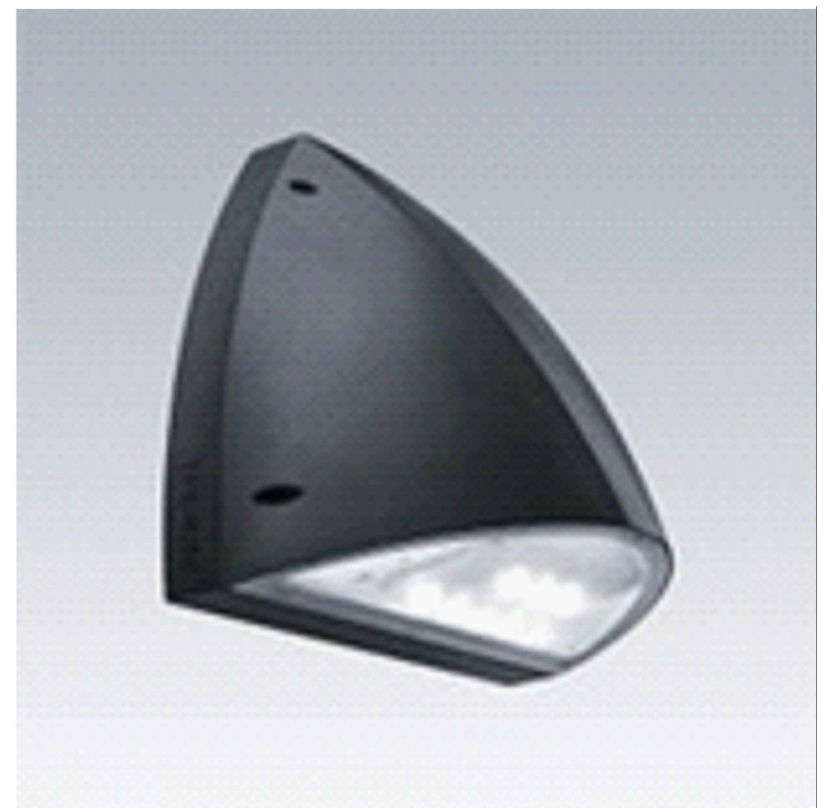
REFERENCE K LUMINAIRE - EXTERNAL LED BULKHEAD LUMINAIRE INCORPORATING PHOTOCCELL CONTROL AND EMERGENCY LIGHTING