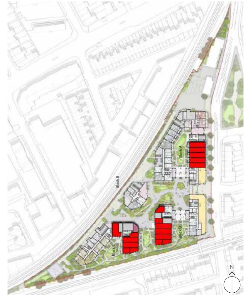
Locations for additional dual-aspect apartments assessed