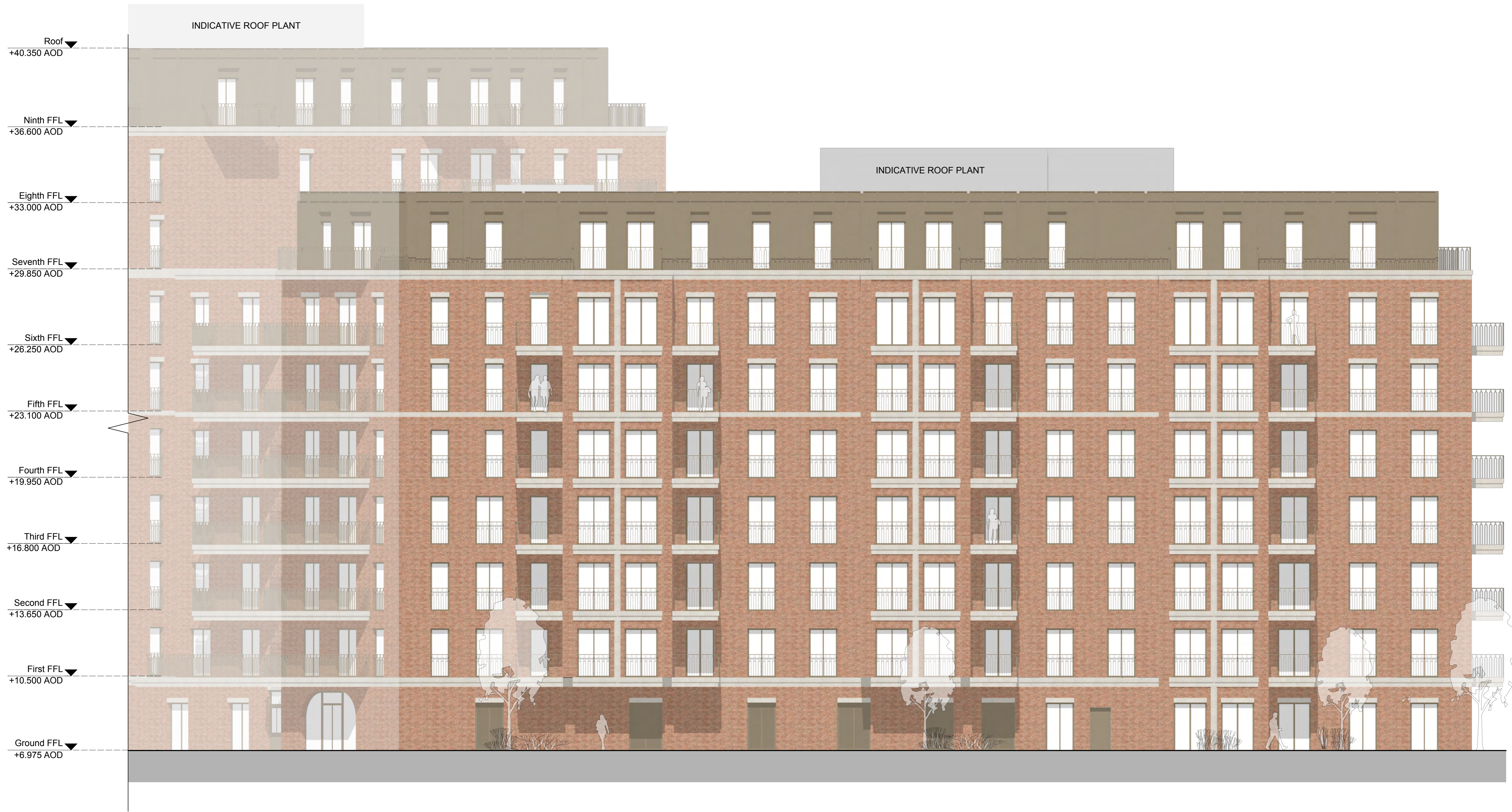
4 Block C West Elevation Scale: 1:100