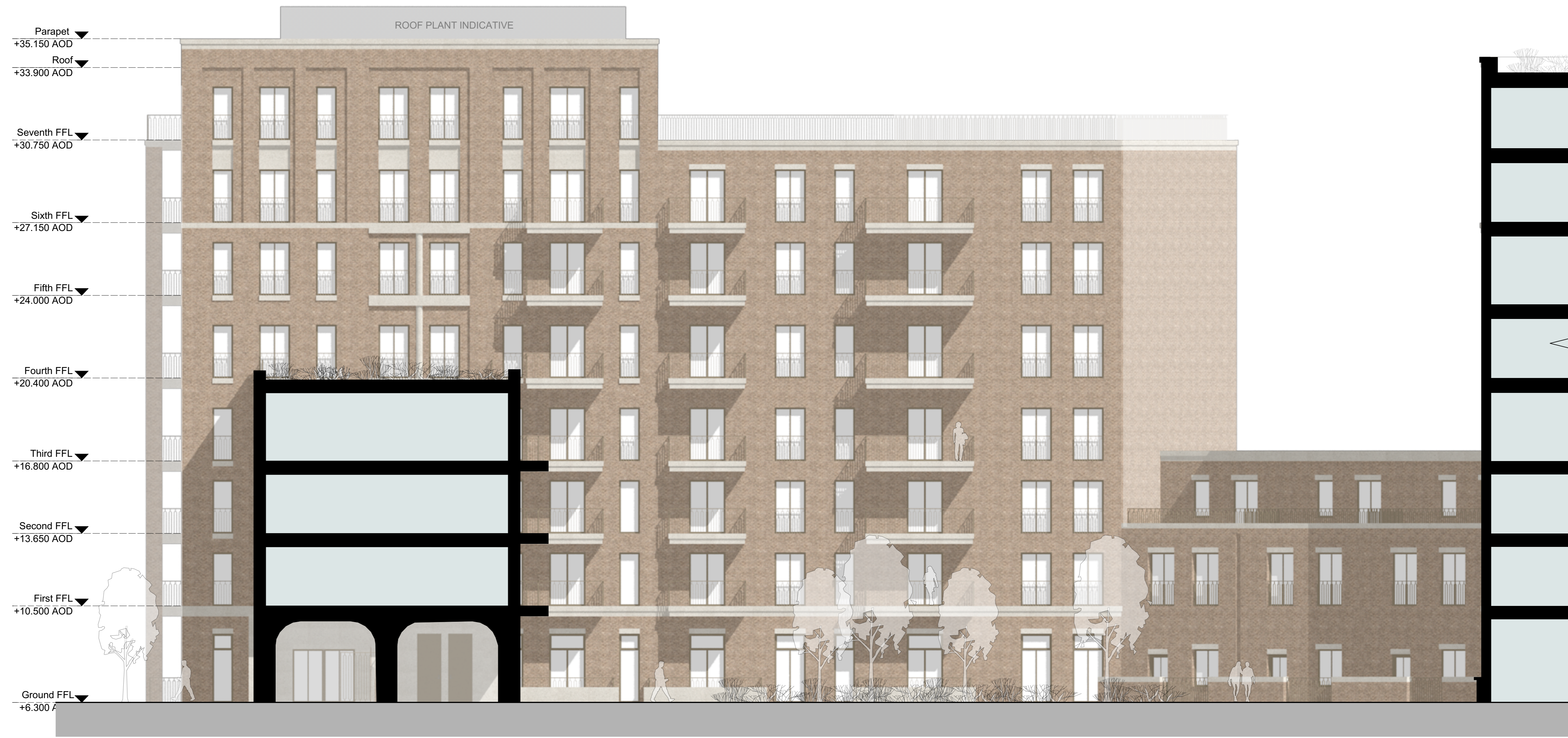
5 Internal Courtyard Elevation - East Scale: 1:100

Assael Architecture Limited 123 Upper Richmond Road London SW15 2TL +44 (0)20 7736 7744 info@assael.co.uk www.assael.co.uk