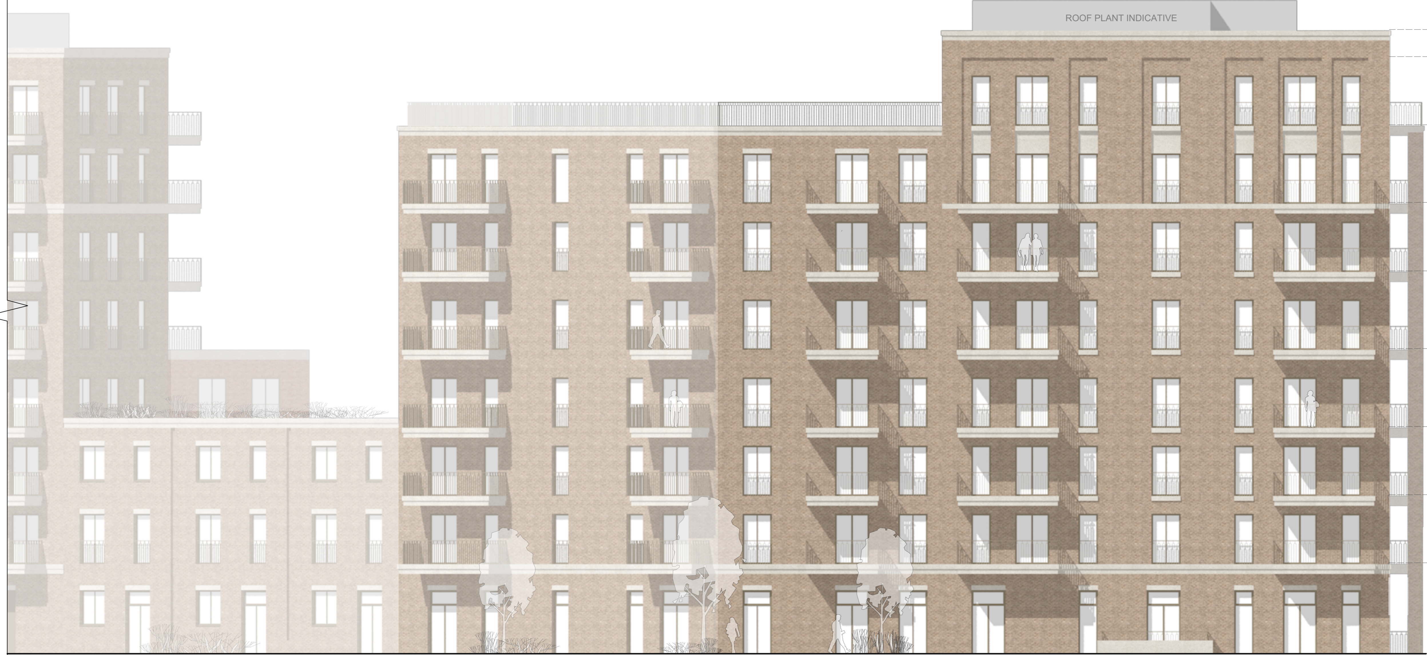
4 Block A West Elevation Scale: 1:100

Assael Architecture Limited 123 Upper Richmond Road London SW15 2TL +44 (0)20 7736 7744 info@assael.co.uk www.assael.co.uk