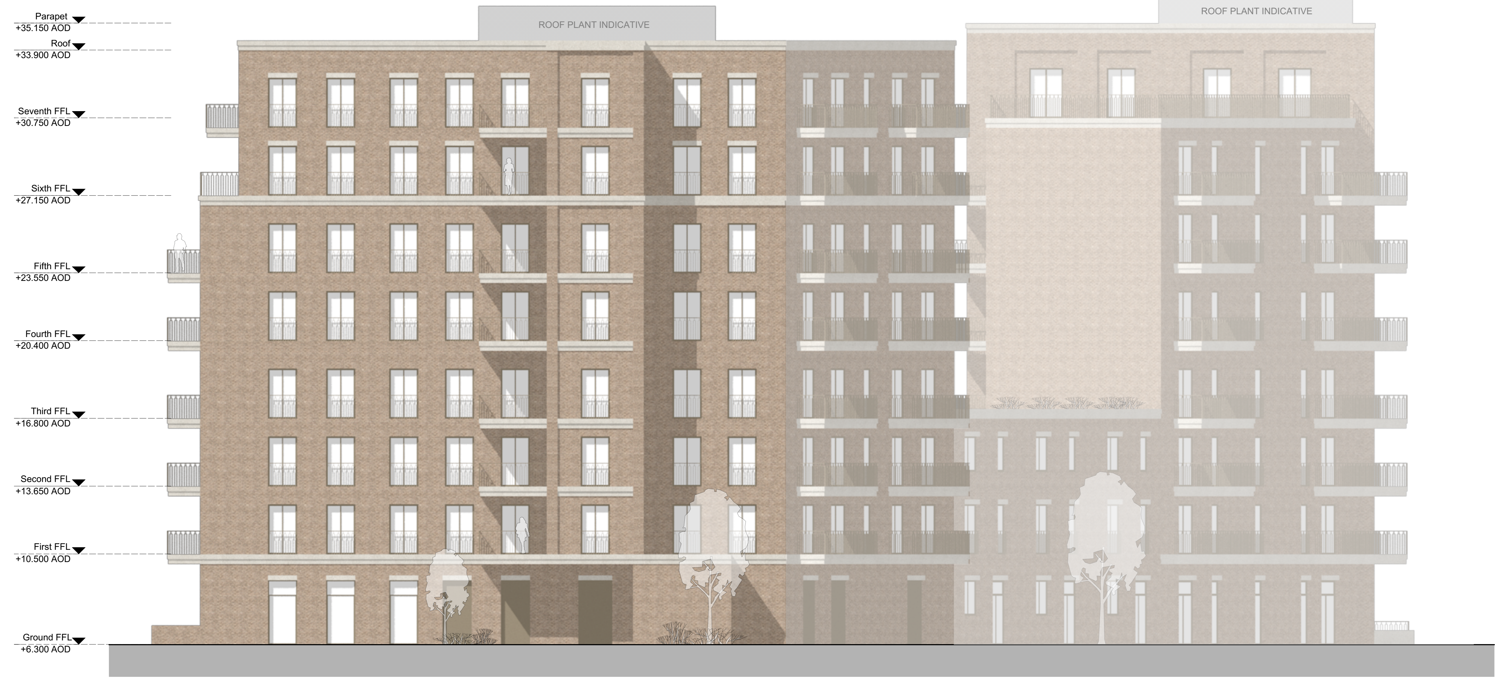
1 Block A North Elevation Scale: 1:100

Assael Architecture Limited 123 Upper Richmond Road London SW15 2TL +44 (0)20 7736 7744 info@assael.co.uk www.assael.co.uk