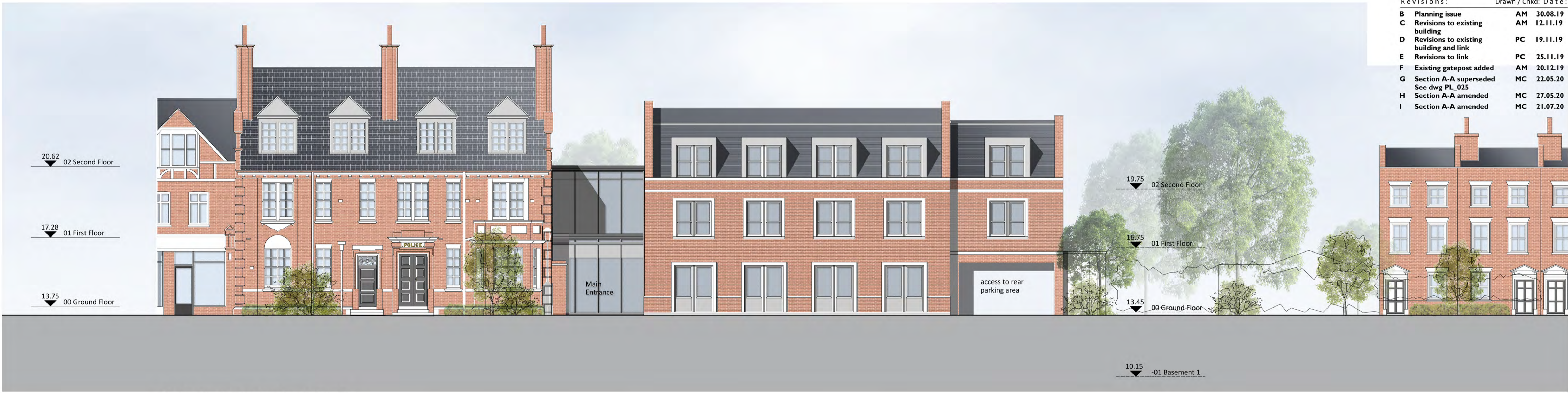
Station Road Elevation - South Elevation I:100