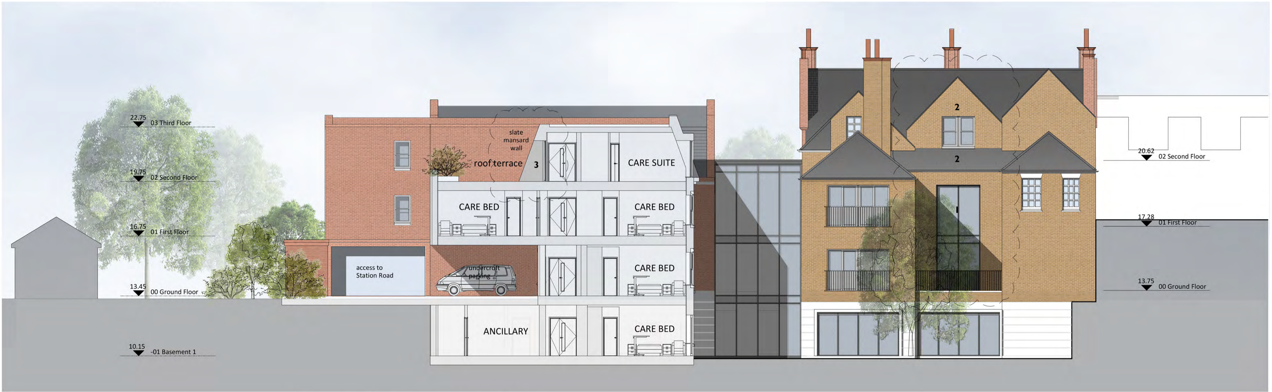
Section A-A - North Elevation through Courtyard Garden I:100