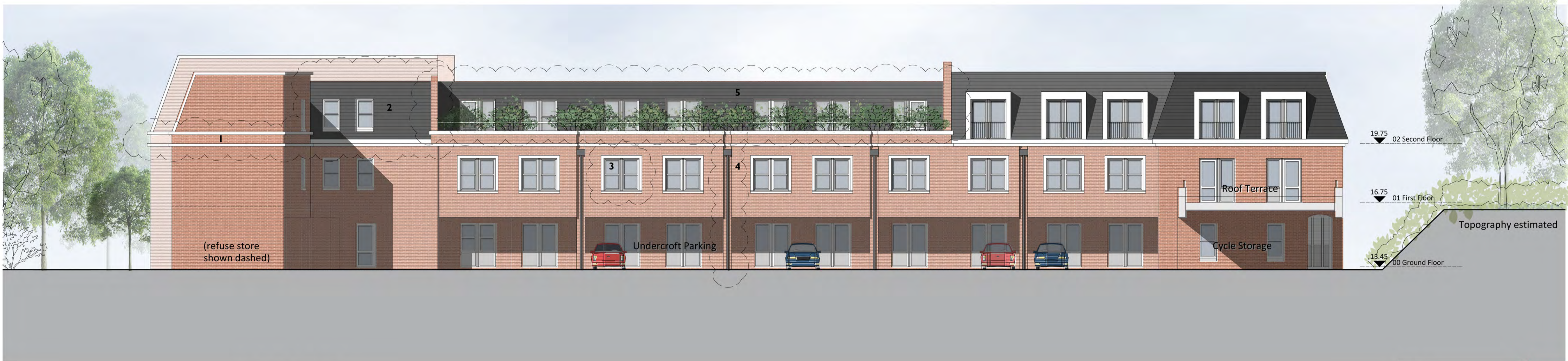
Elevation F - East Elevation 1:100