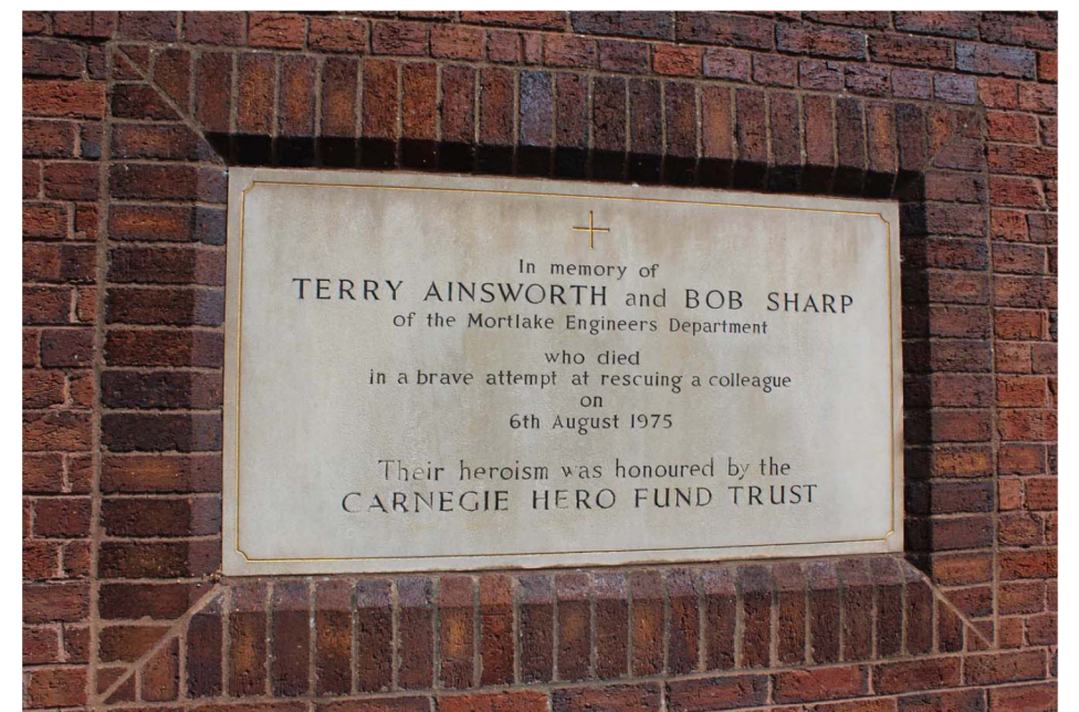
B Existing memorial Plaque - to Brewery workers who lost their lives attempting to rescue a colleague