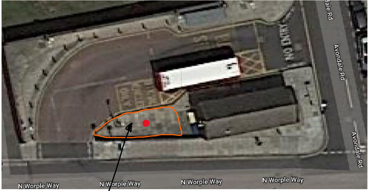
Old Bus Depot

Pavement/ waiting area to be allocated for EE equipment