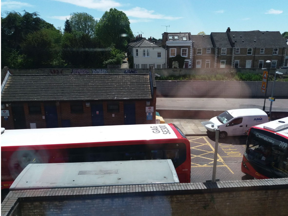
View from Dovecote Gardens Flat Number 11