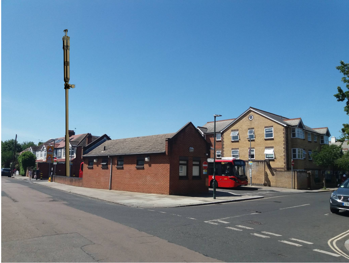
Dovecote Gardens & bus depot from junction of Avondale Rd & North Worple Way