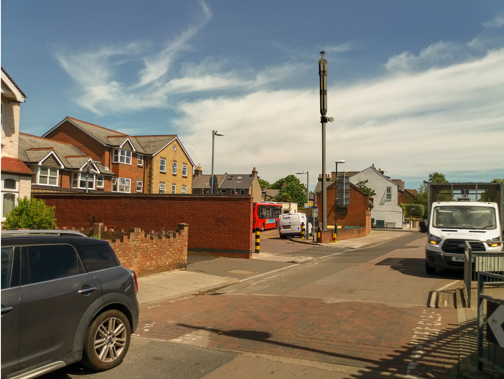
Image of monopole 5G mast. Streetlight Circa 5m - Mast 3 X height of street light.