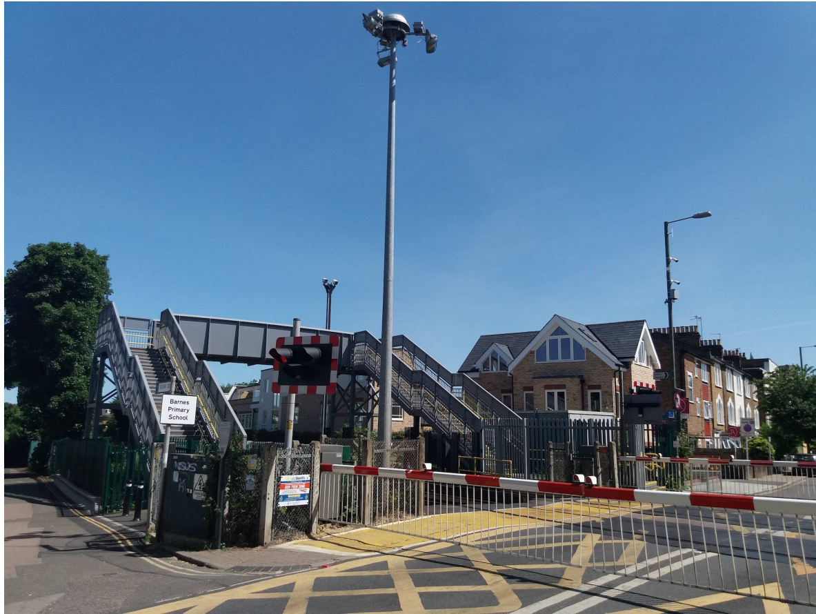
View of White Hart Lane crossing from North Worple Way