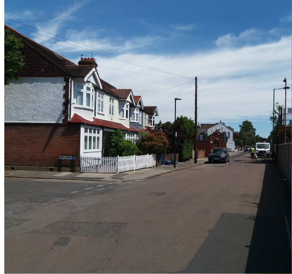
View from NWW looking East