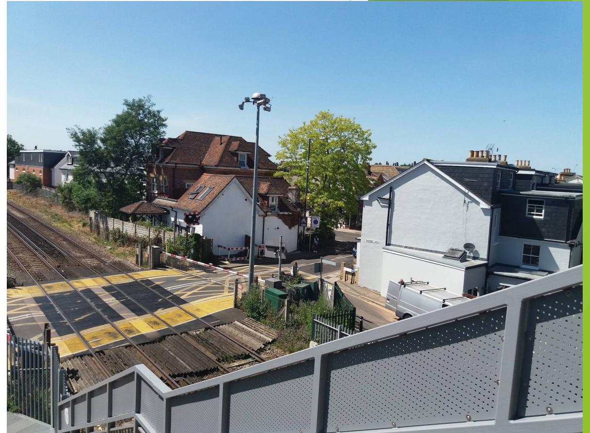
View of White Hart Lane crossing from footbridge