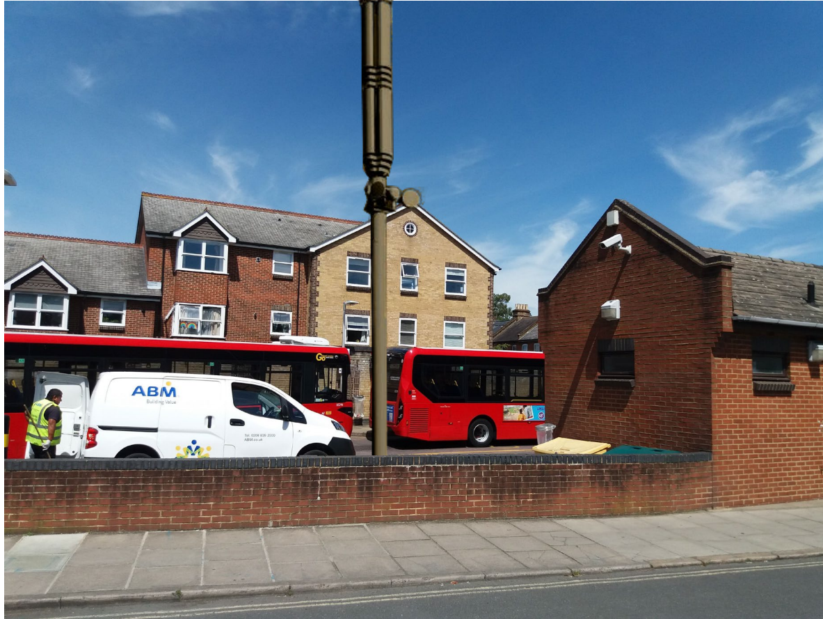
View from NWW looking back at Dovecote Gardens