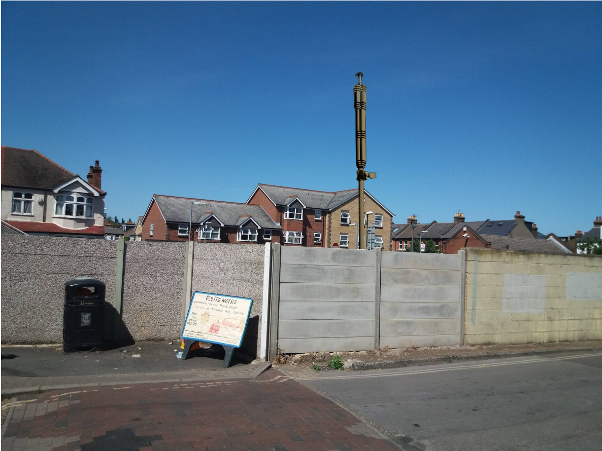
View of Dovecote Gardens from junction of South Worple Way & Queens Road