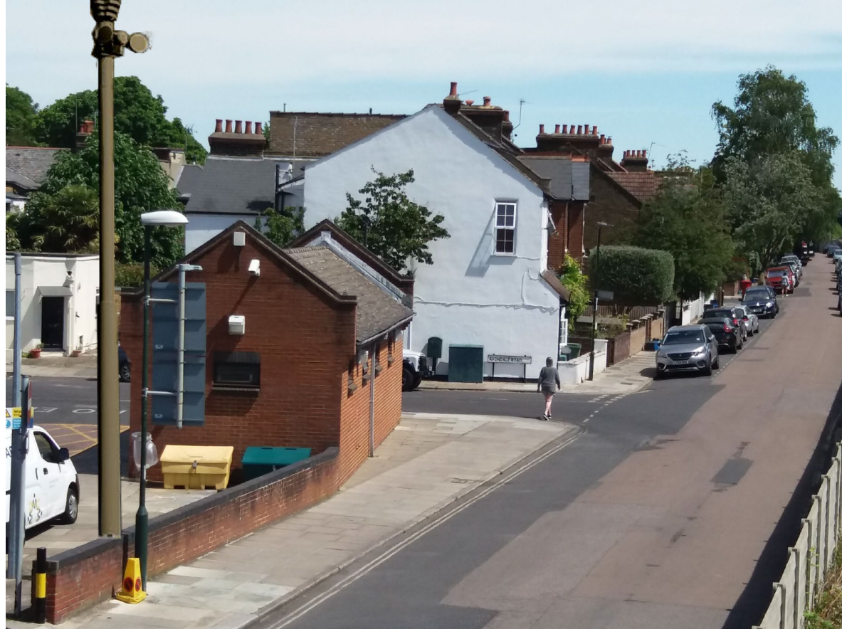
View from pedestrian bridge over tracks looking towards bus Depot