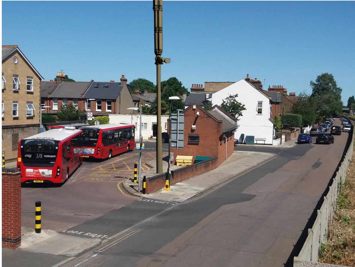
View of Dovecote Gardens & bus depot from footbridge