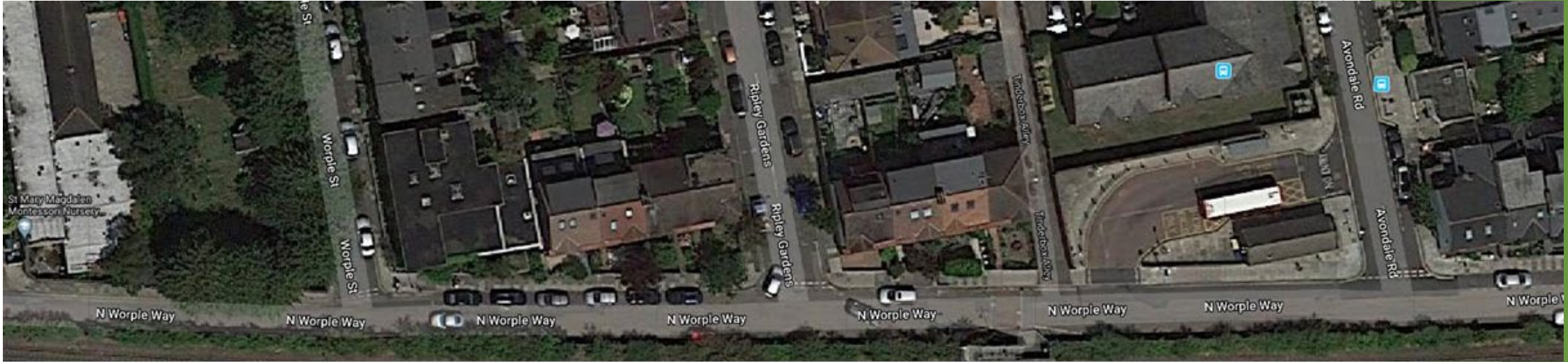
Montessori nursery School - Parking along North Worple Way