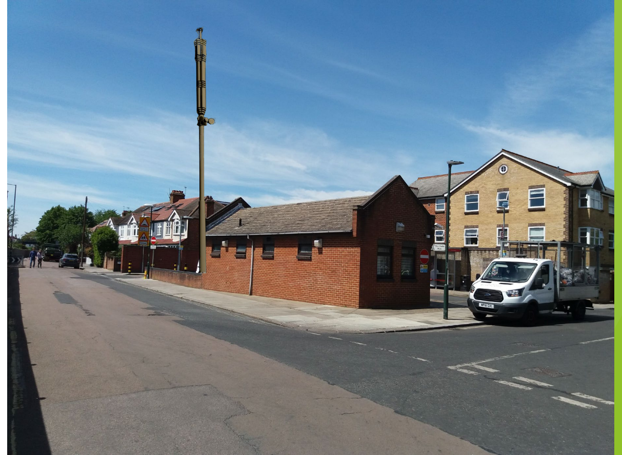
View from corner of Avondale Rd & North Worpole Way (NWW)