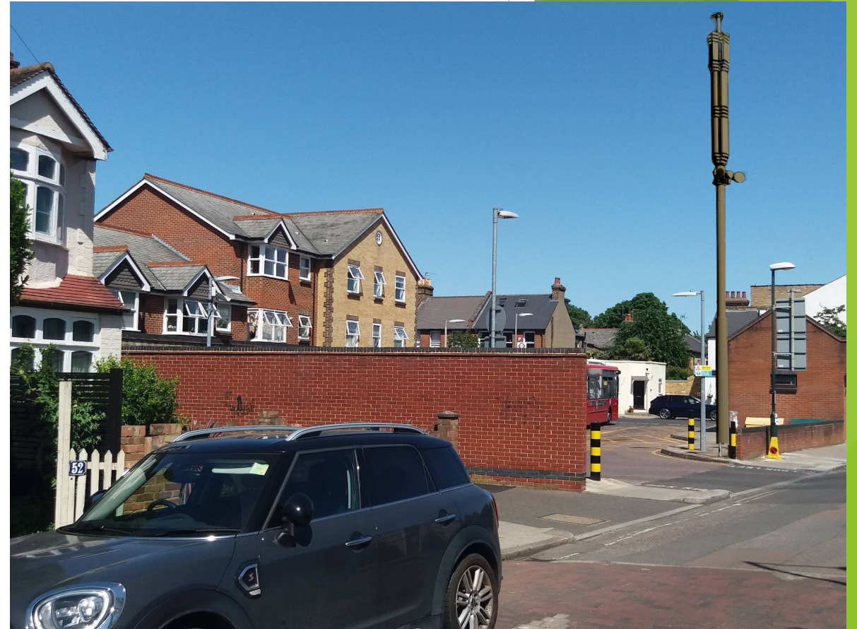
View from North Worple Way looking from the West at Dovecote Gardens