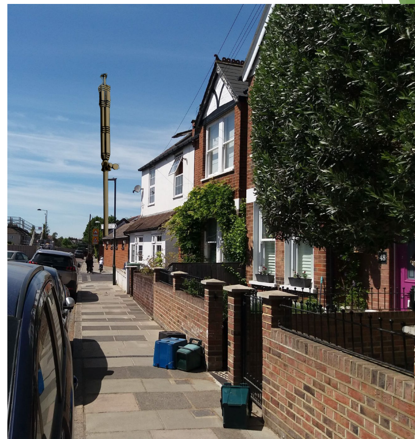
Views from North Worple Way - looking West