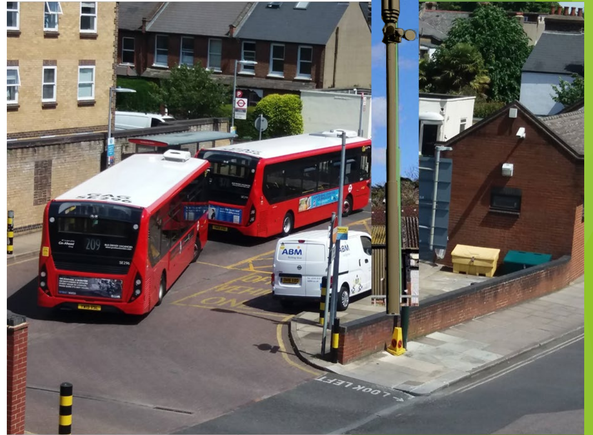
View of Bus Depot including existing bus stop