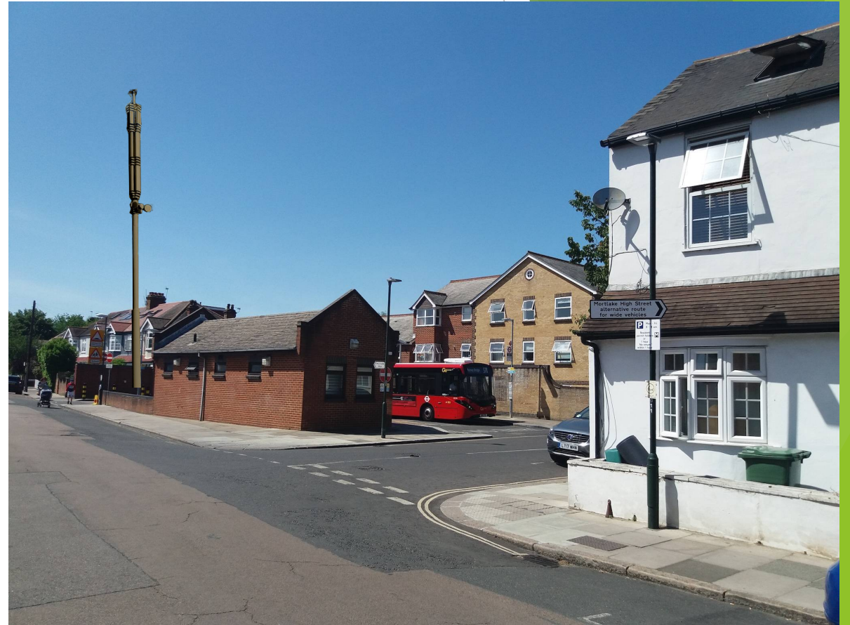
Dovecote Gardens & bus depot from junction of Avondale Rd & North Worple Way