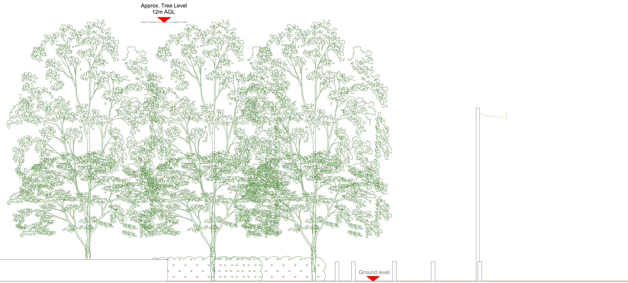
EXISTING ELEVATION A