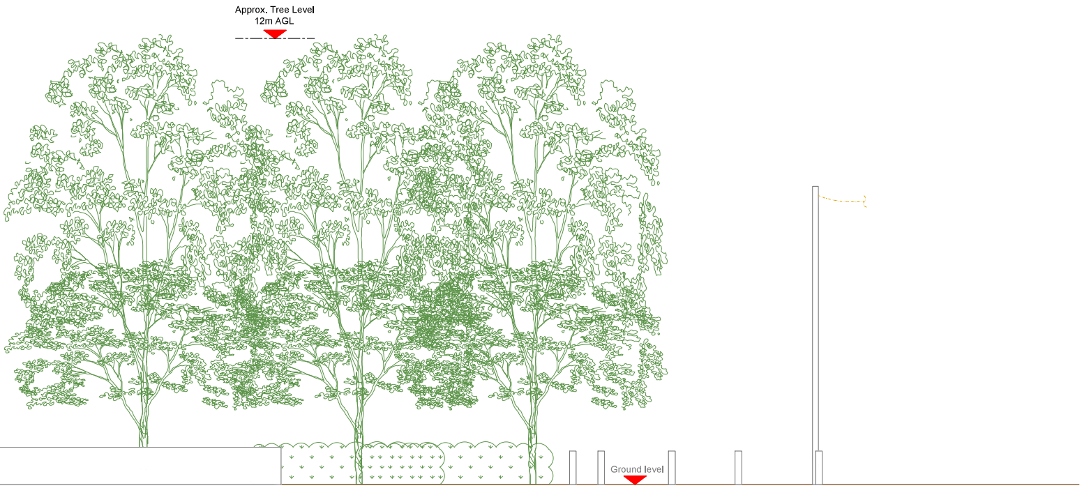
EXISTING ELEVATION A

NOTES: 1. ALL DIMENSIONS IN MM UNLESS OTHERWISE NOTED.