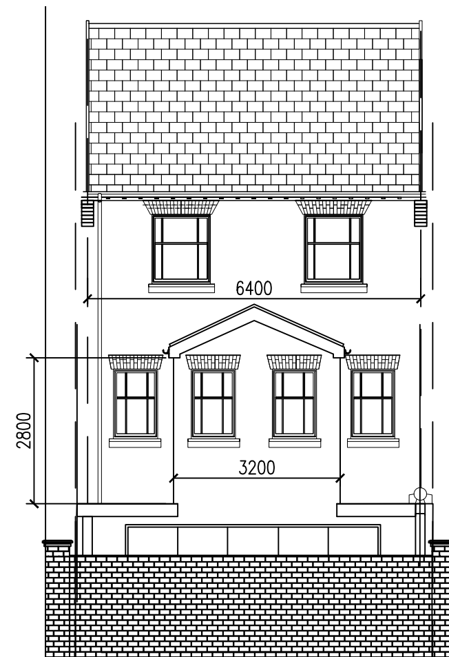
SCALE 1:100 REAR ELEVATION