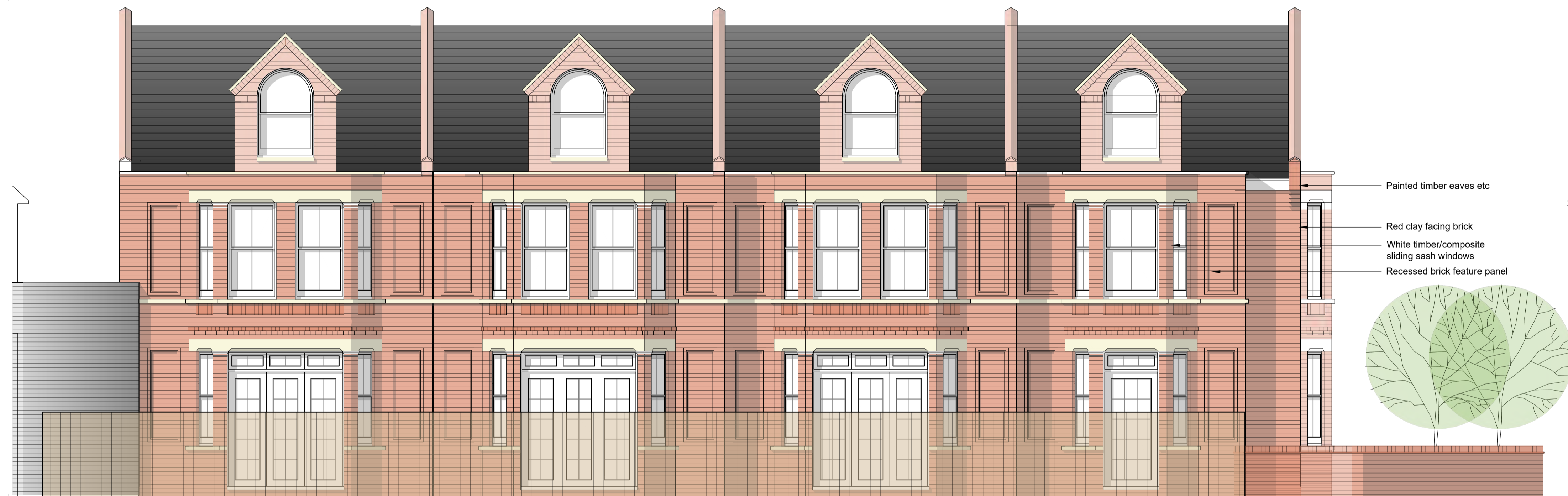
Proposed Drummond Place (South-Facing) Elevation