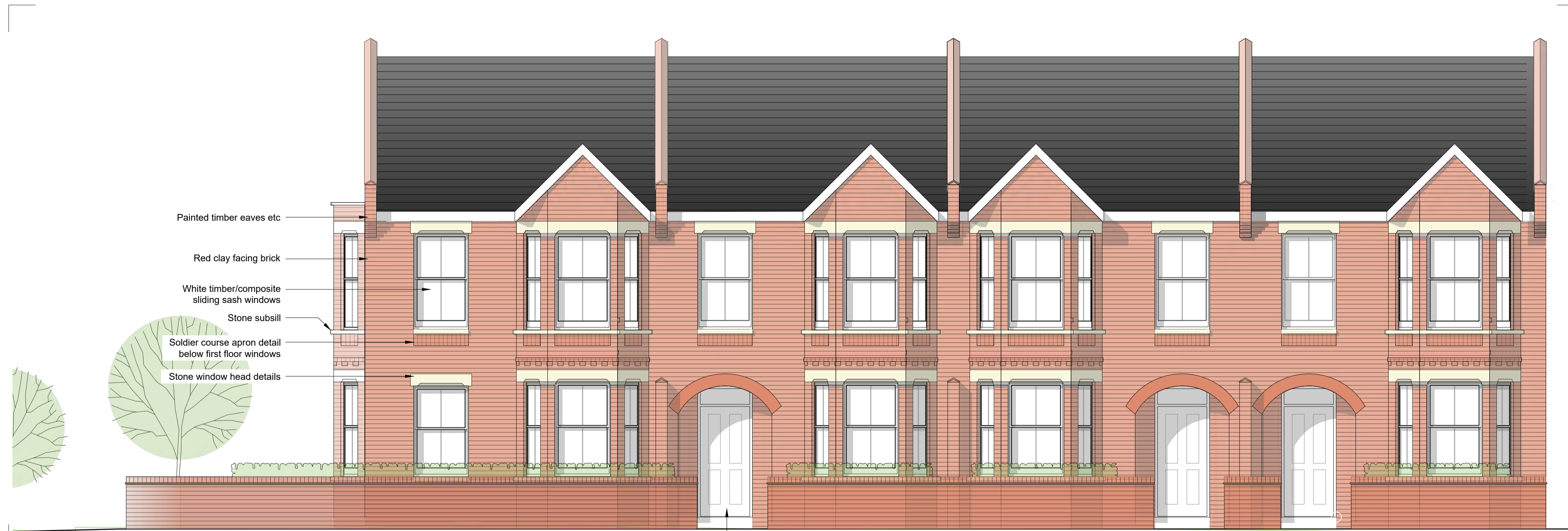
Proposed Godstone Road (North-Facing) Elevation

Paneled timber front doors with glazed toplight over