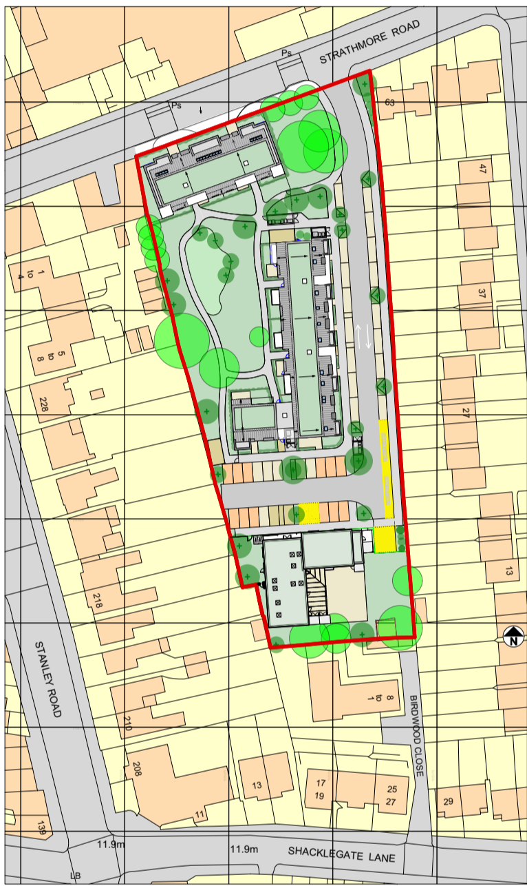
LOCATION PLAN 1:1250 0 20 40 60 80 100 M

Ordnance Survey, (c) Crown Copyright 2016. All rights reserved. Licence number 100022432