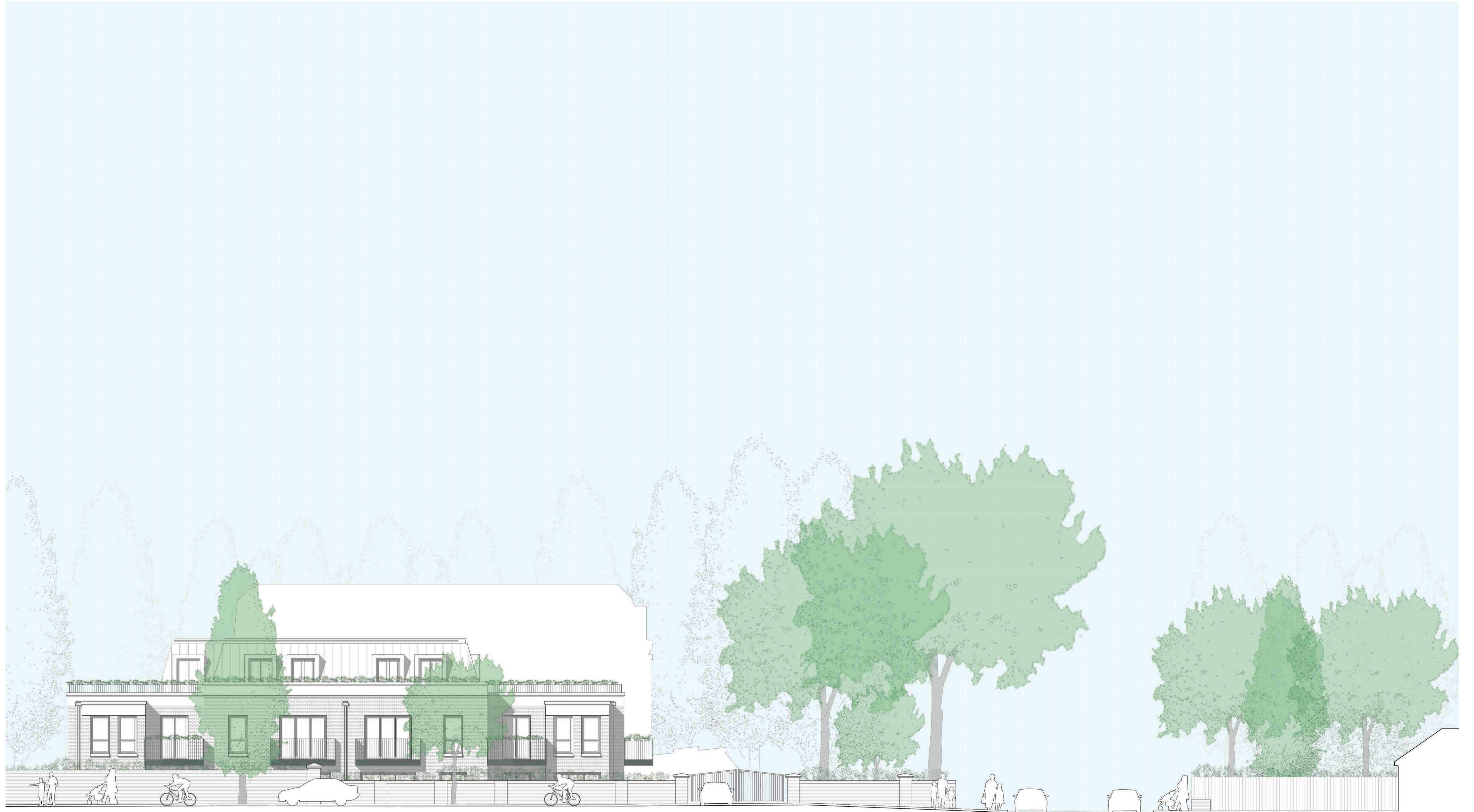
38 - 42 Hampton Road (Application Site) Hampton Road