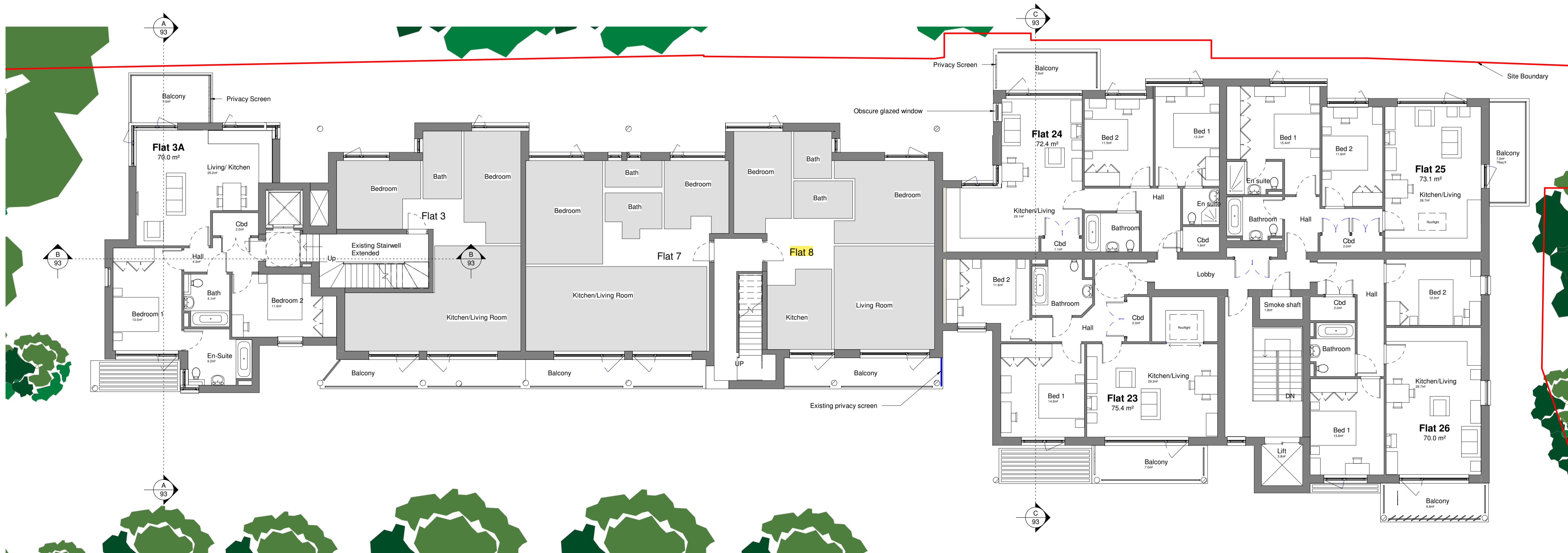
2 Second Floor 1:100

Upstairs at the Grange Bank Lane, London SW15 5JT T 020 8487 1223 F 020 8876 4172 E info@brookesarchitects.co.uk www.brookesarchitects.co.uk