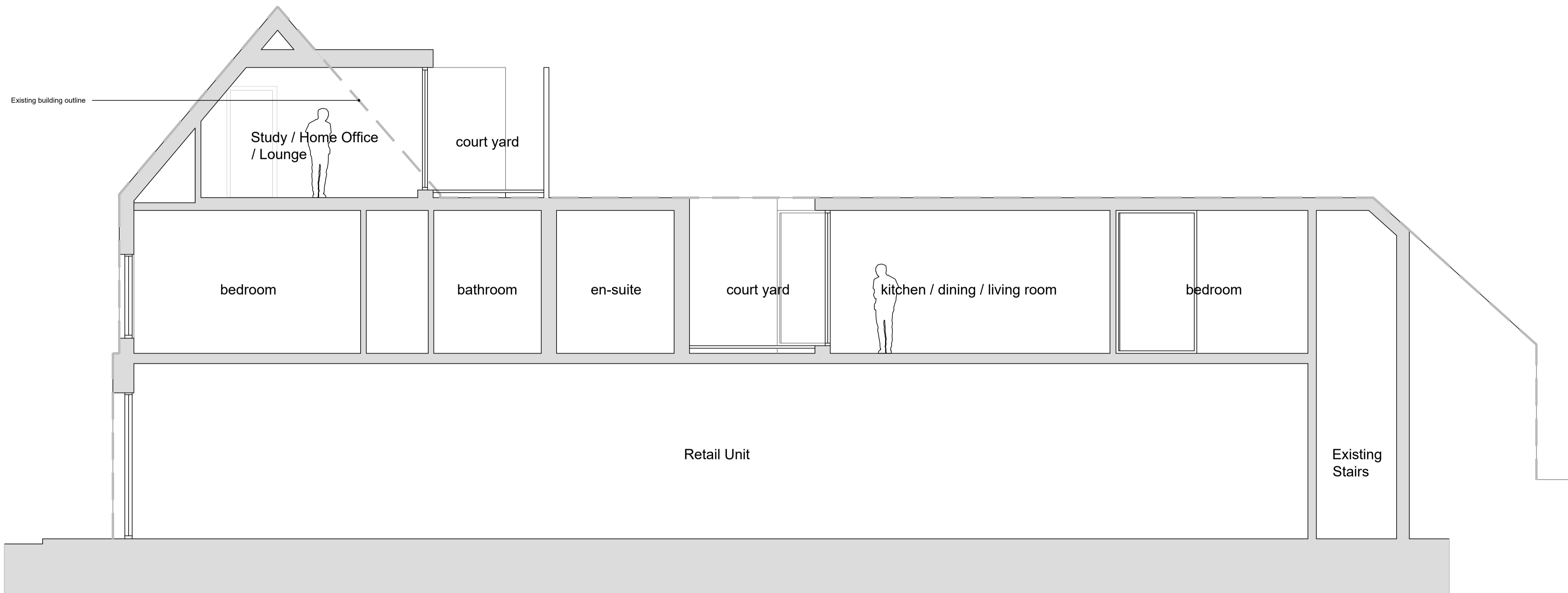
Section Scale: 1/50