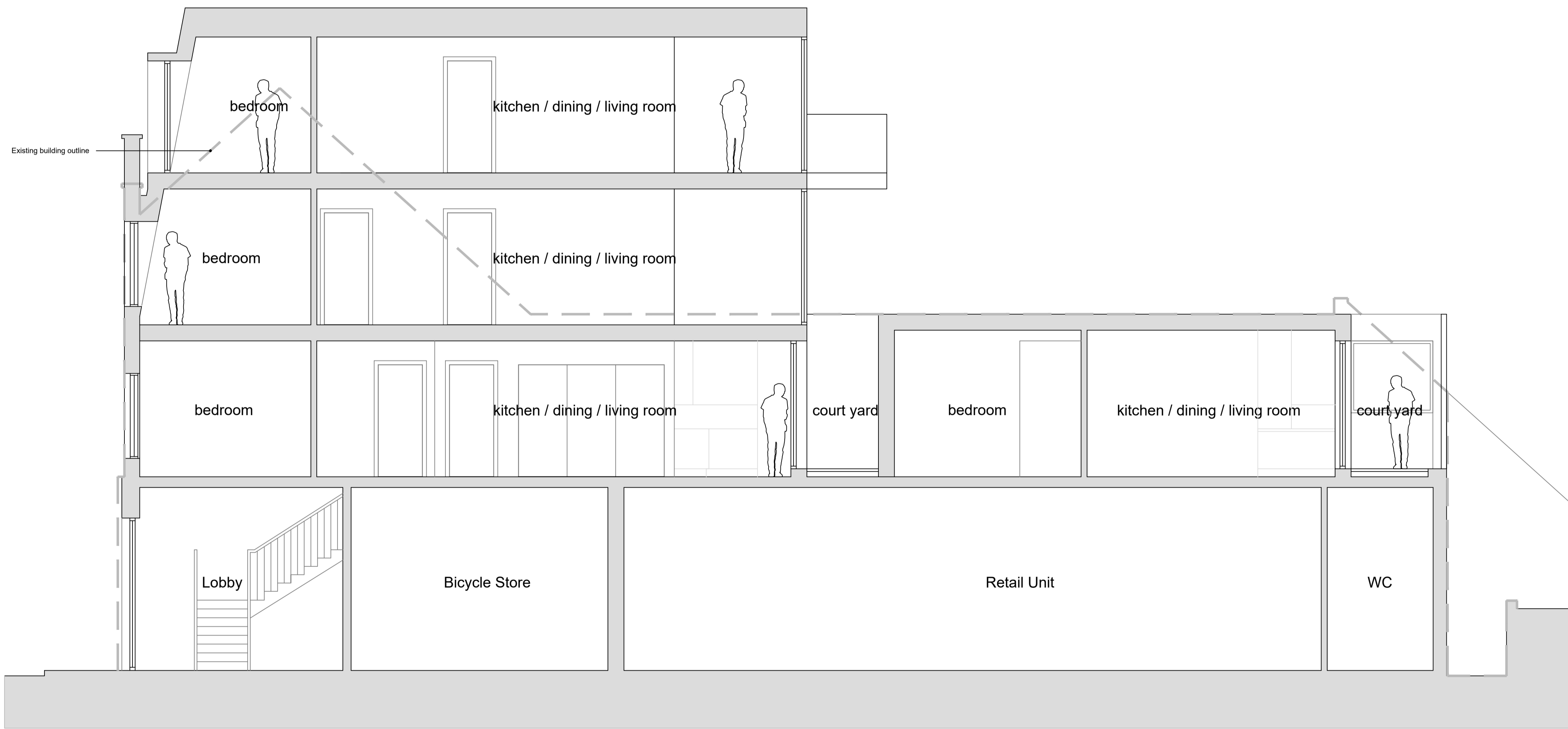
Section Scale: 1/50