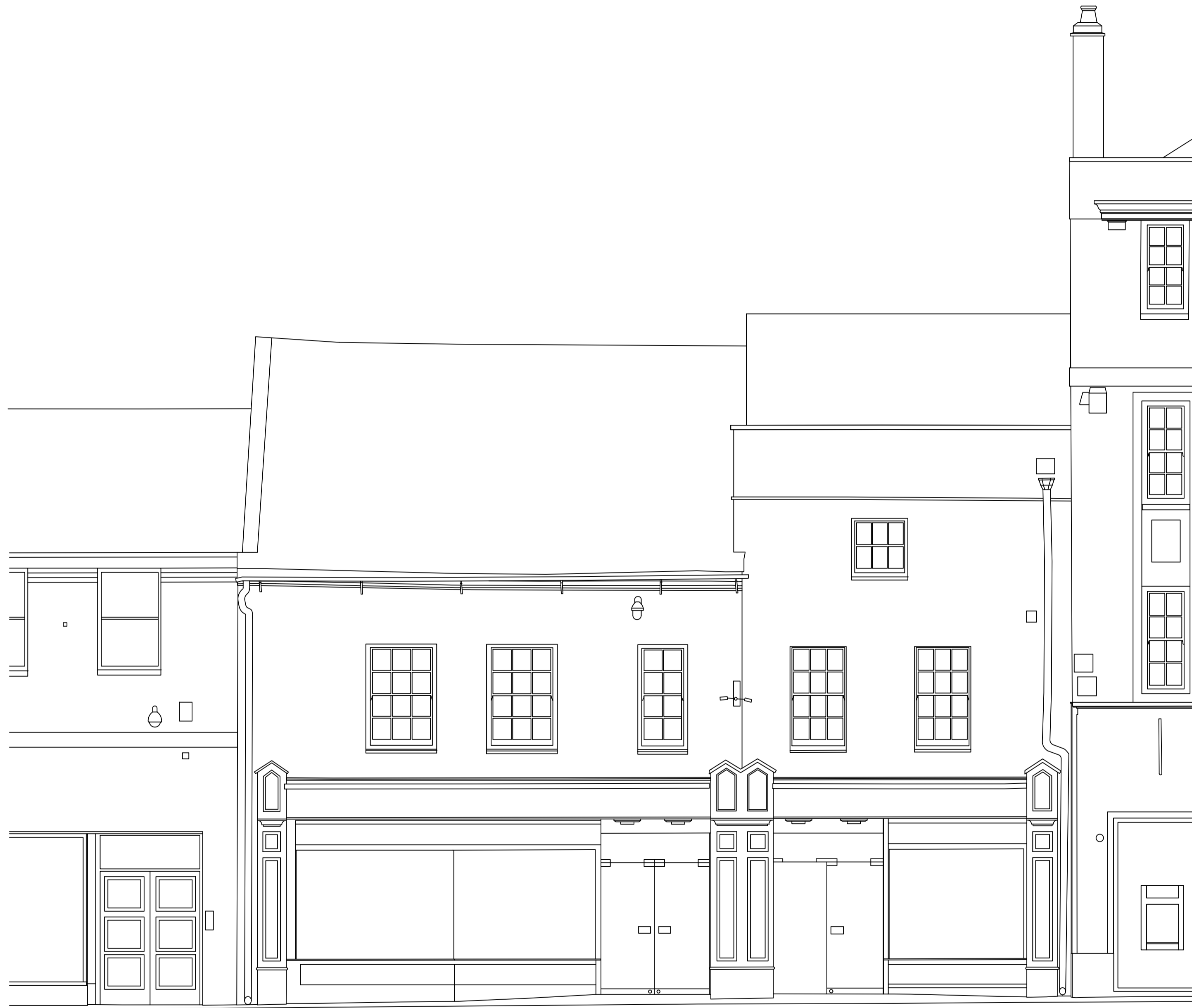
Front Elevation Scale: 1/50