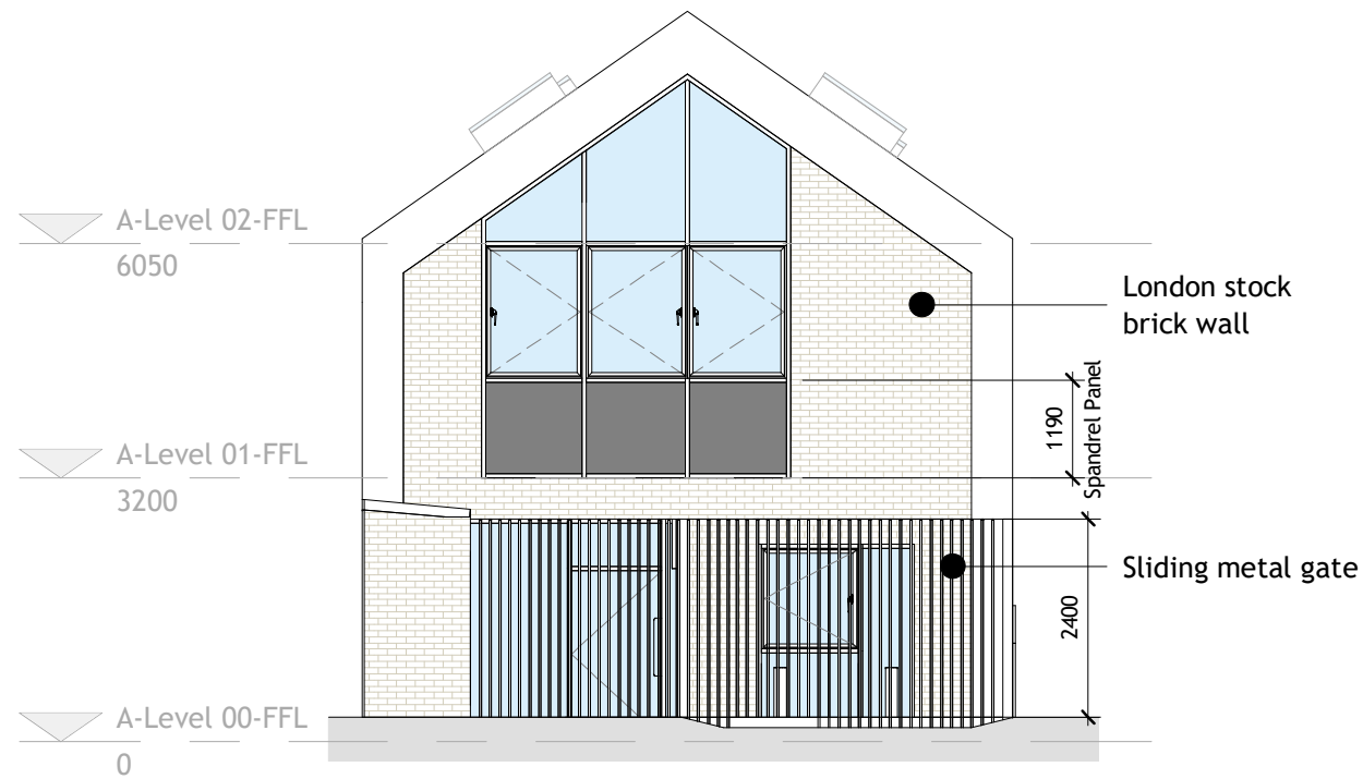
1 Cross St. / Front Elevation (SW) 1 : 100