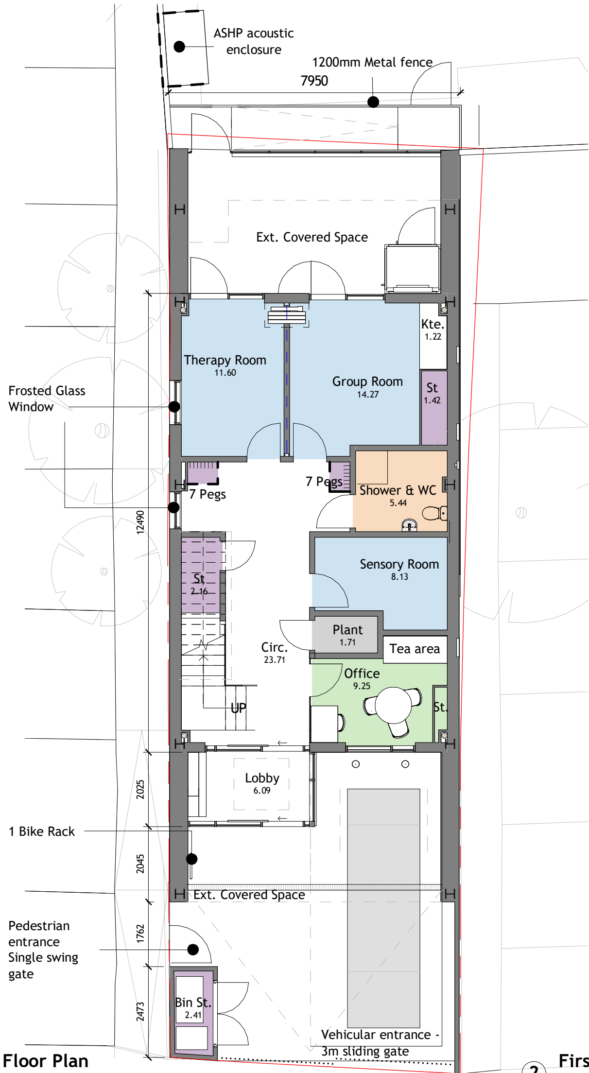
1 Ground Floor Plan