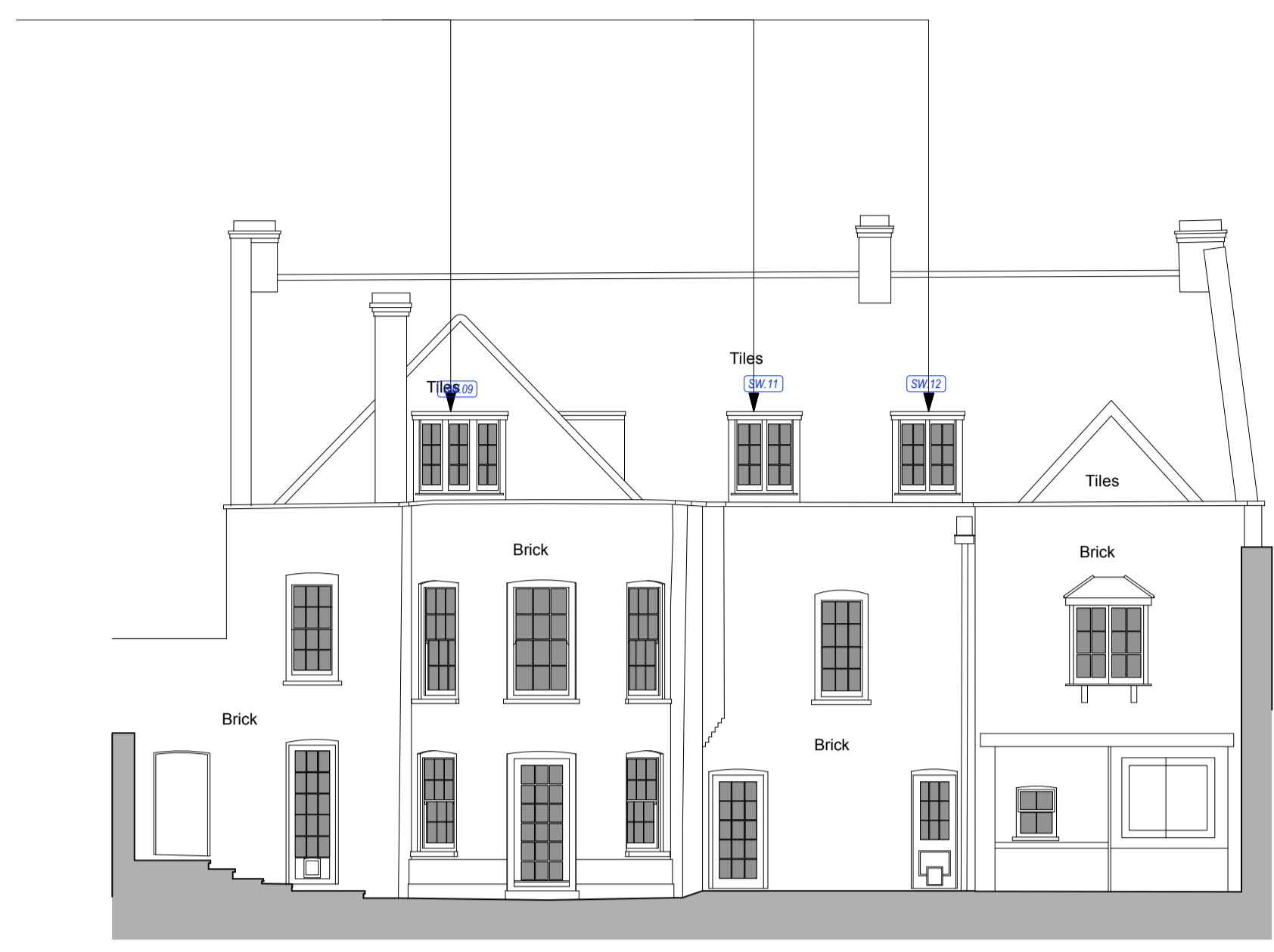
GARDEN ELEVATION S-W