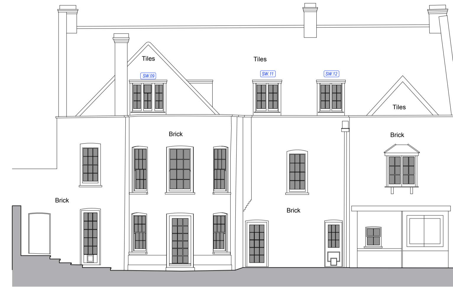
GARDEN ELEVATION S-W