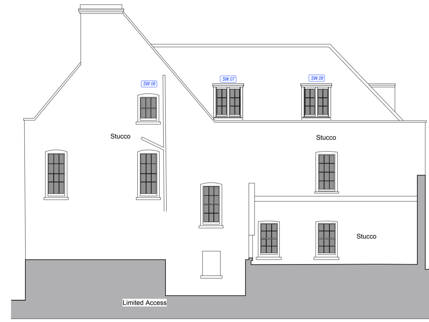
SIDE ELEVATION N-W