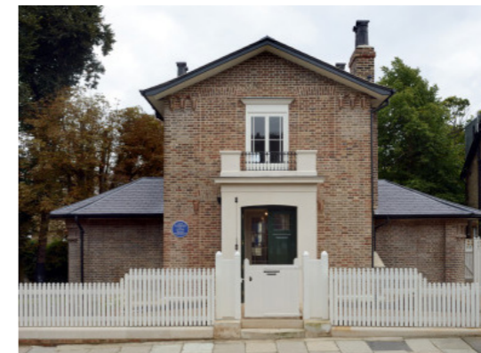
TURNER'S HOUSE (SANDYCOMBE LODGE)