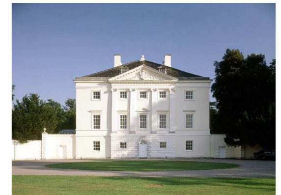
MARBLE HILL HOUSE