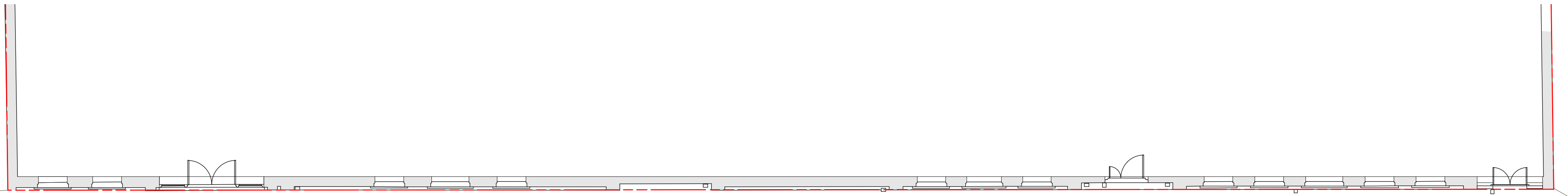
1 GROUND FLOOR PLAN - SOUTH ELEVATION - EXISTING + PROPOSED (No change) Scale 1:100 @ A2