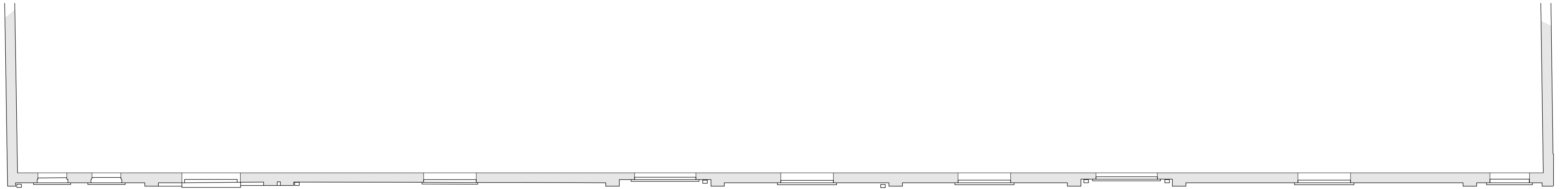
2 FIRST FLOOR PLAN - SOUTH ELEVATION - EXISTING + PROPOSED (No change) Scale 1:100 @ A2