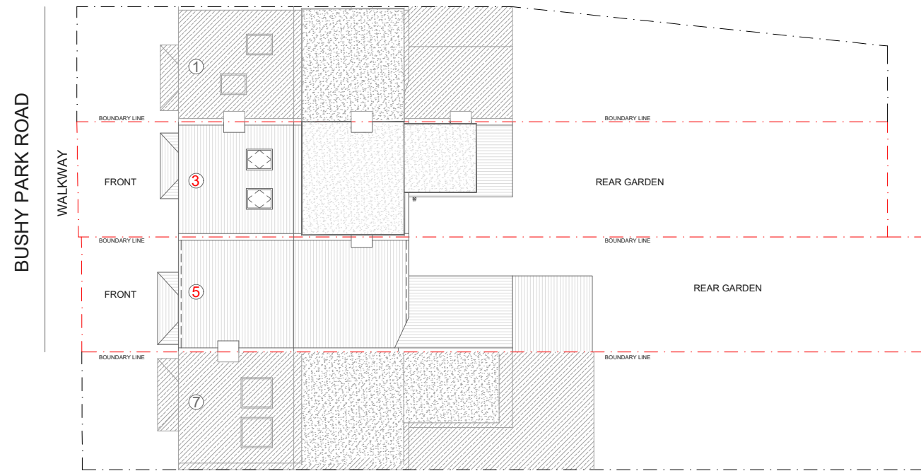
EXISTING SITE PLAN SCALE 1:200