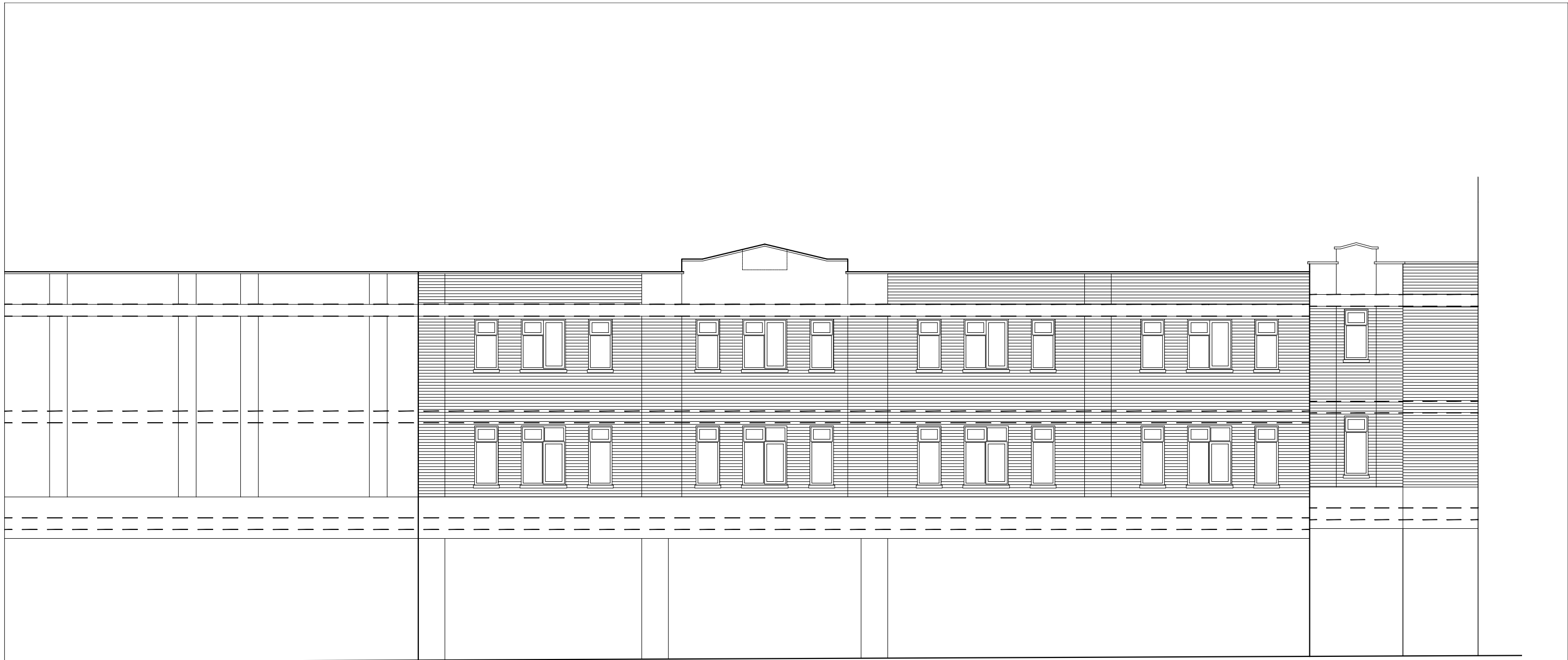
Proposed main elevation -1