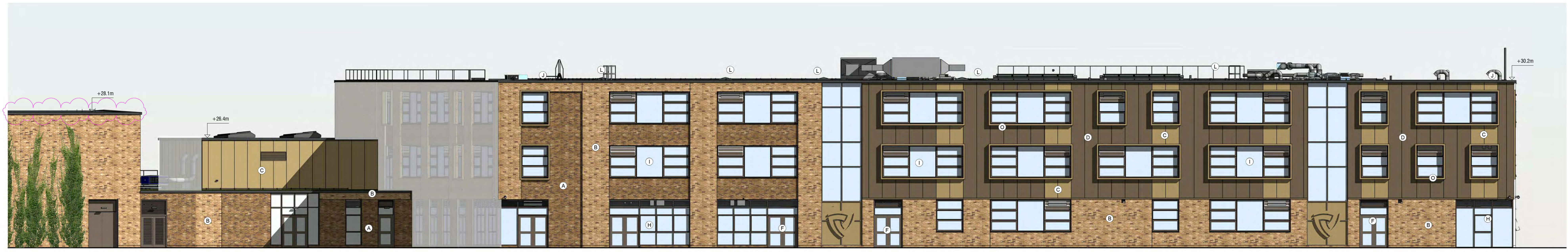
1 South Elevation 1:100