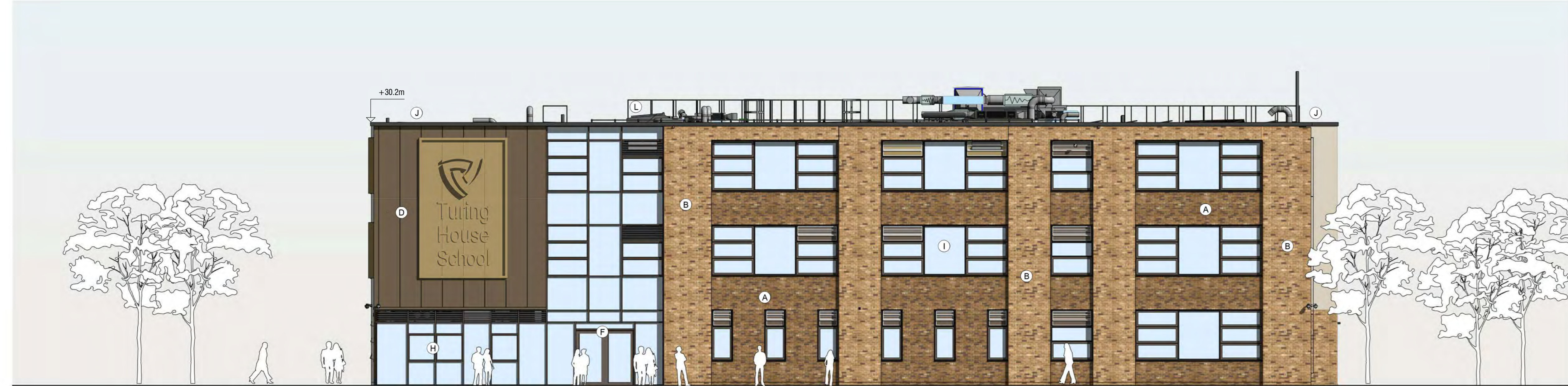
3 East Elevation - Main Entrance Frontage 1:100