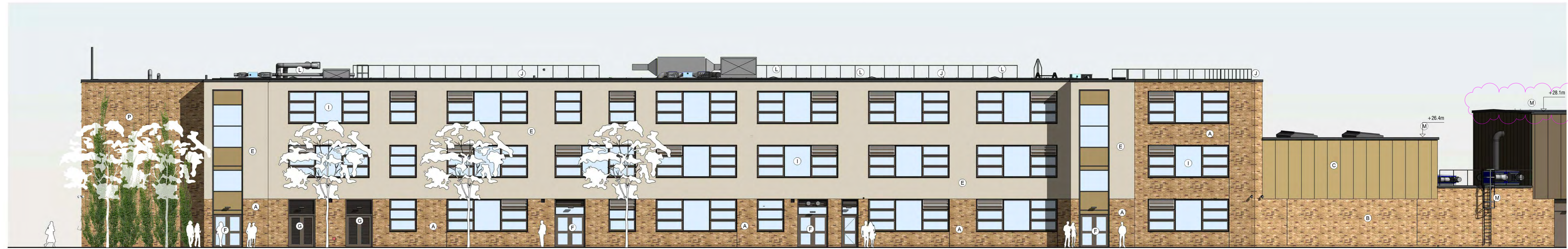
2 North Elevation - Rear Main Building 1:100