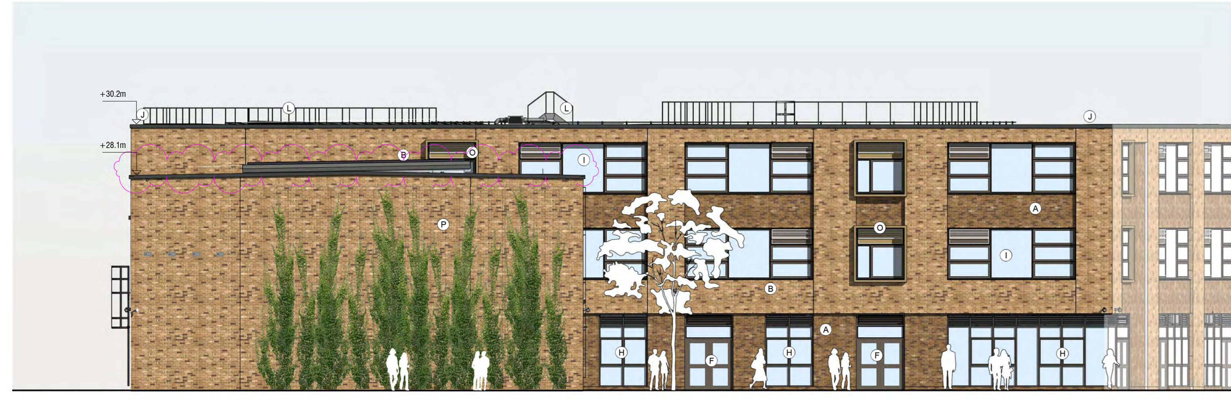
4 West Elevation - Sports Block gable and Main Building 1:100