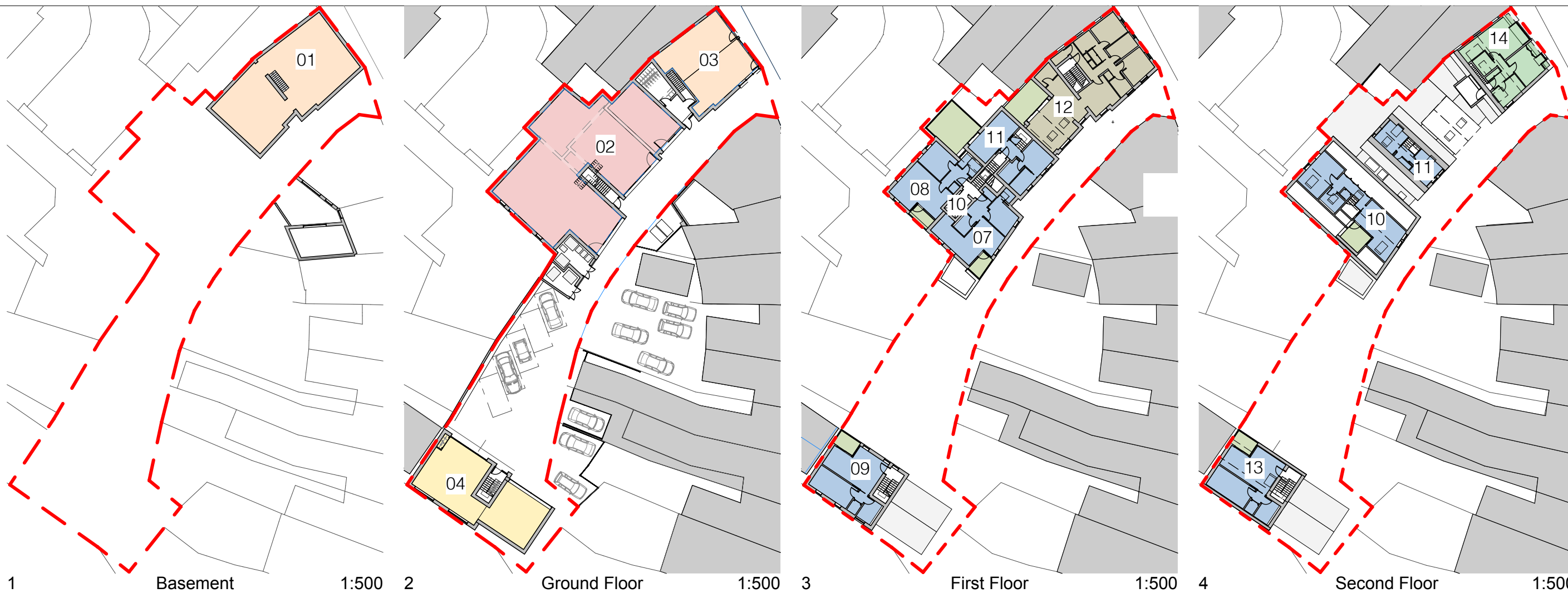
1 Basement 1:500 2 Ground Floor 1:500 3 First Floor 1:500 4 Second Floor 1:500