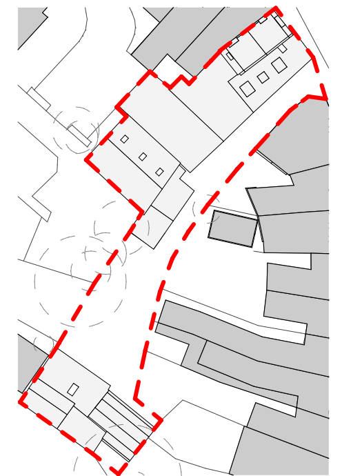
5 Key 1:750