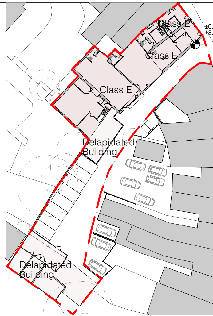
2 Ground Floor 1:500