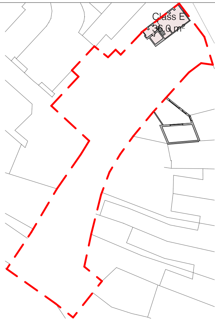
1 Basement 1:500