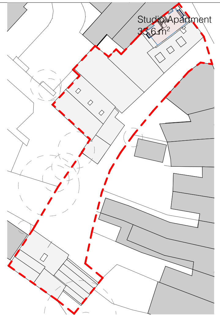
4 Second Floor 1:500