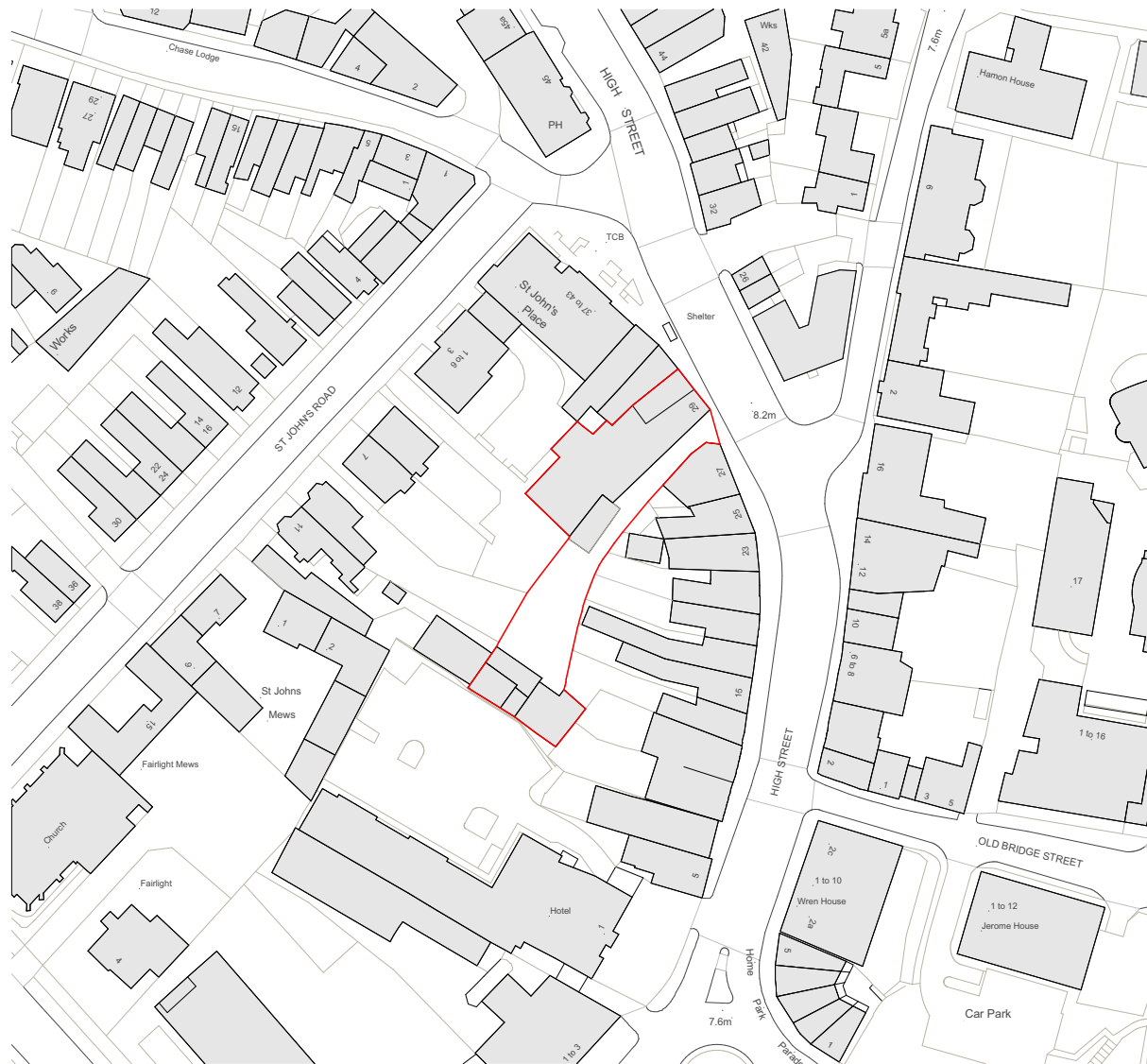
1 OS Map 1:1250