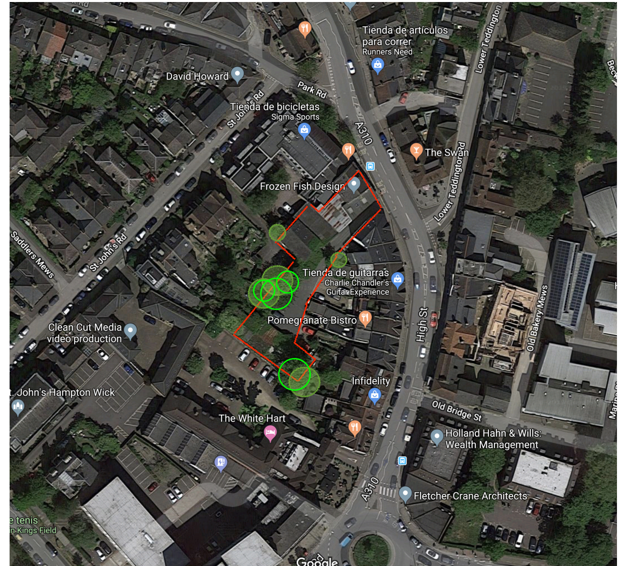
2 Aerial map

Key: Site Boundary — Trees Survey — Site Area = 920 m 2