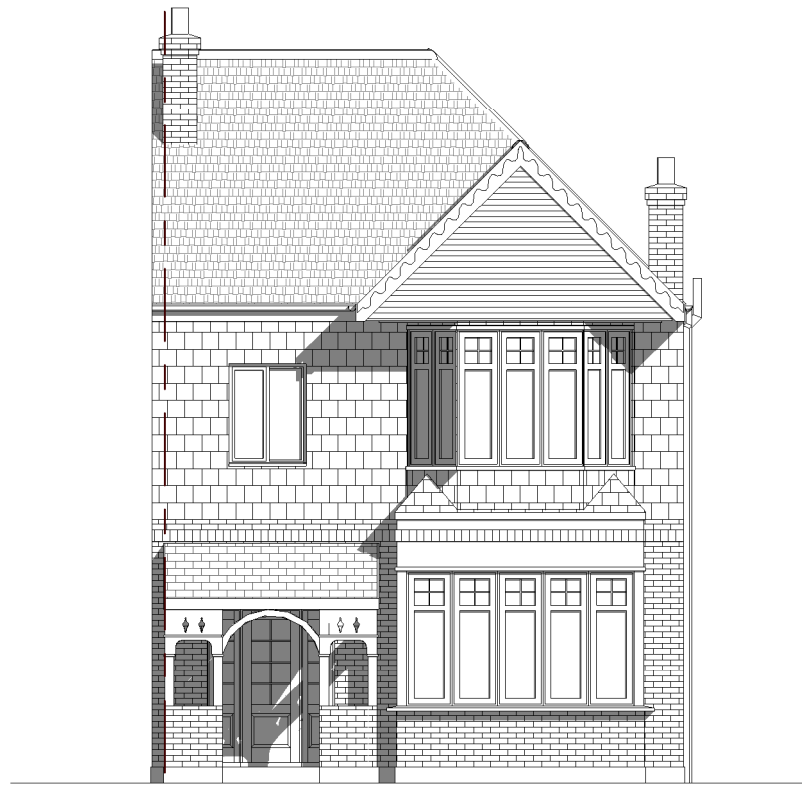
4 EXISTING FRONT ELEVATION 1 : 100