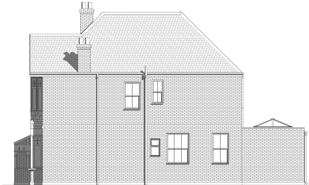
1 EXISTING SIDE ELEVATION 1 1 : 100