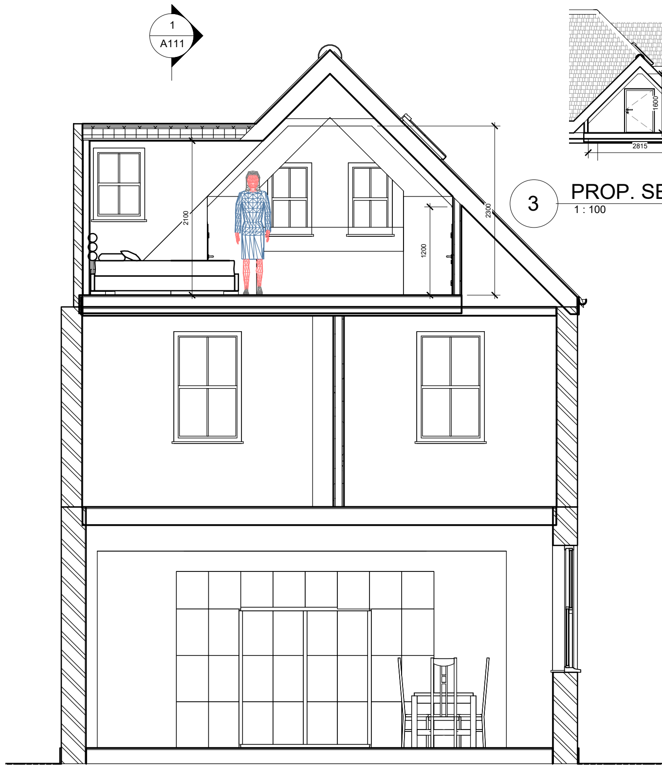
3 PROP. SECT. 6 1:100