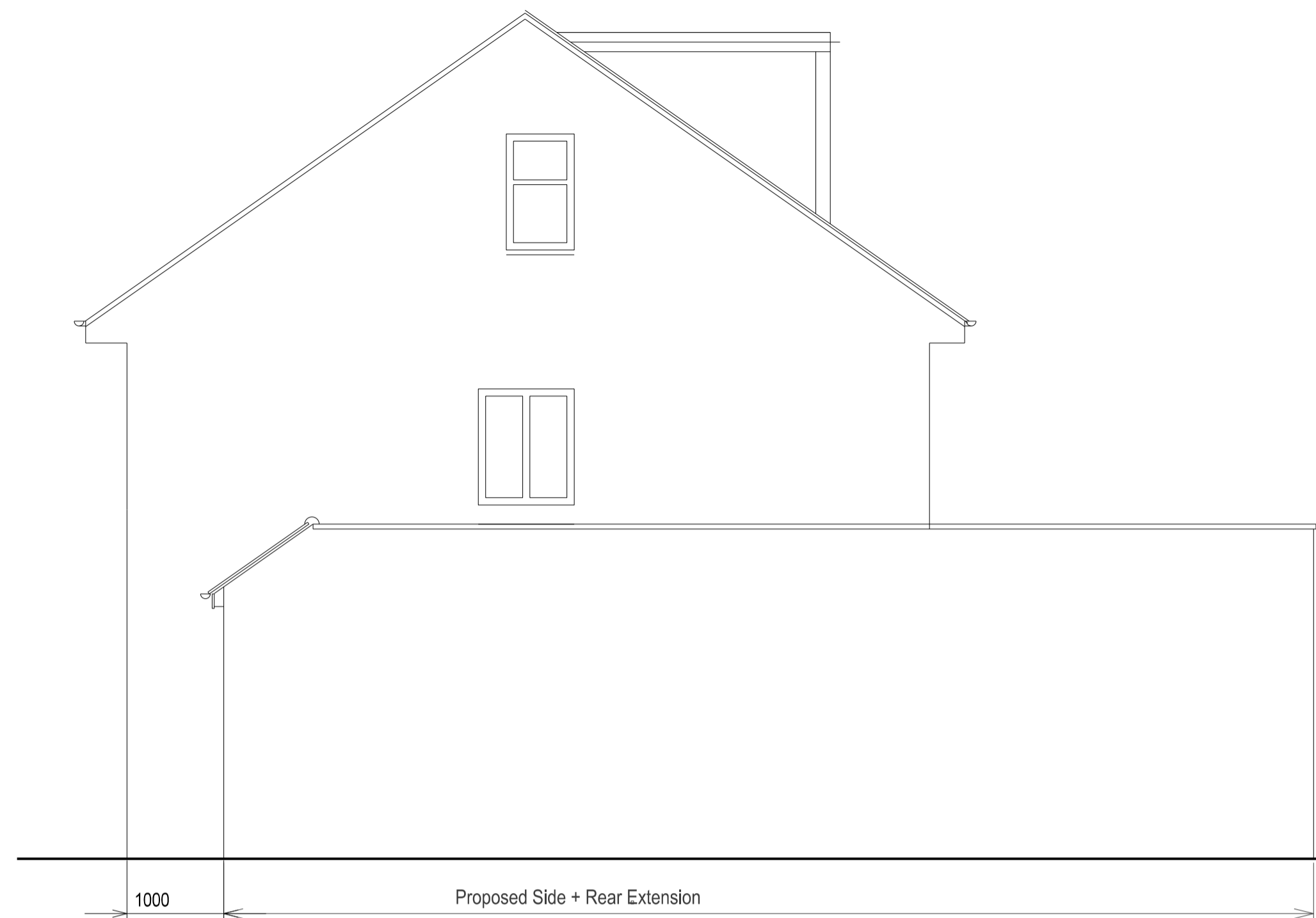
SIDE ELEVATION facing No.2