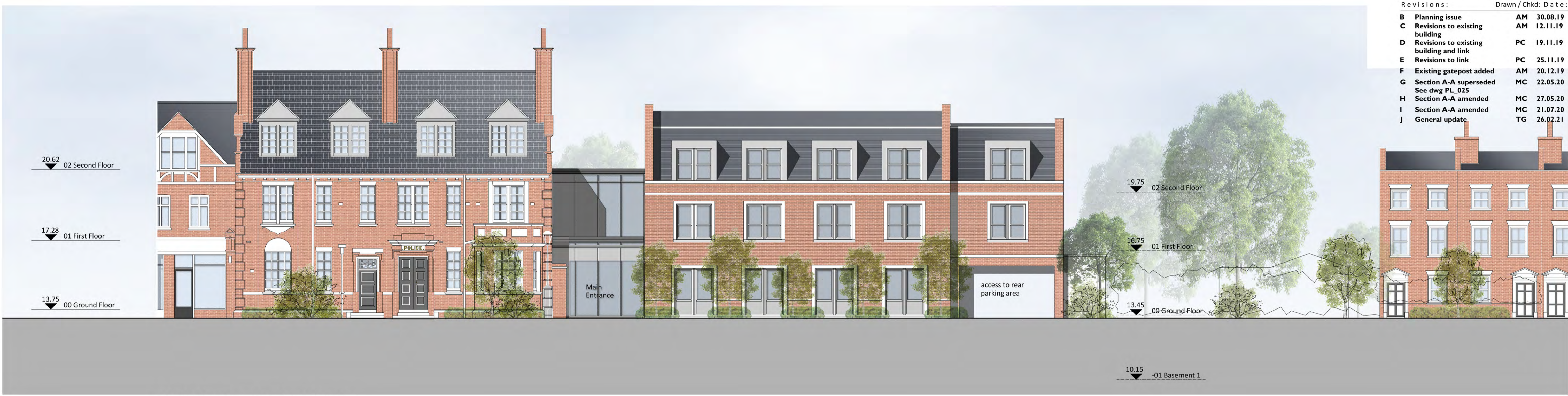
Station Road Elevation - South Elevation 1:100