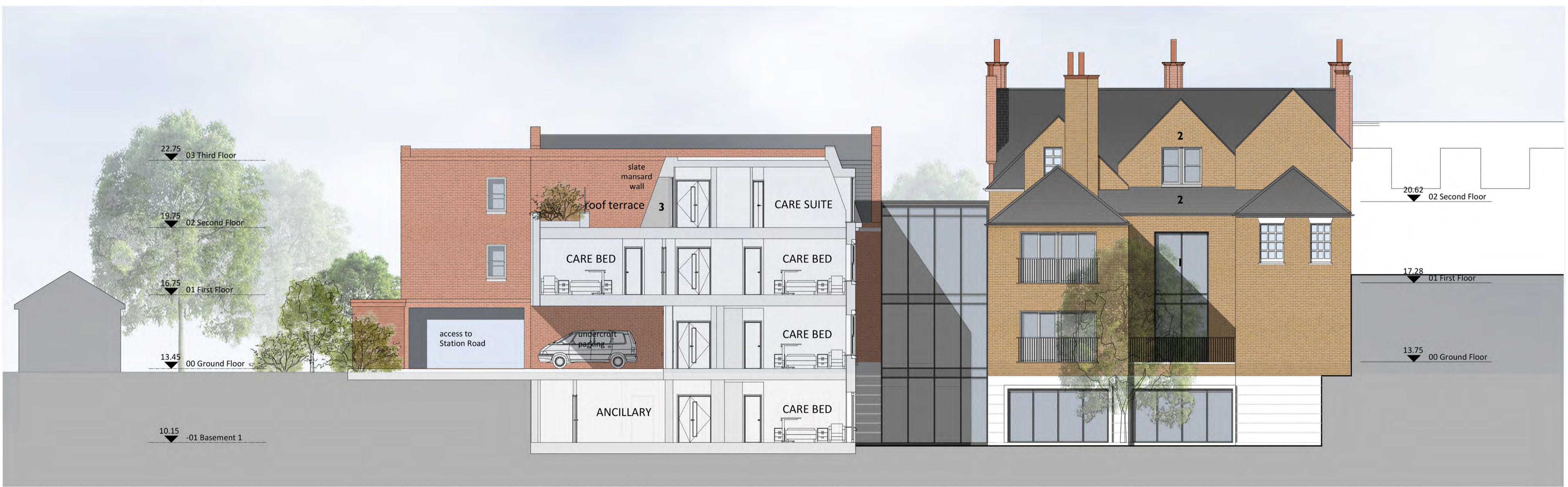
Section A-A - North Elevation through Courtyard Garden 1:100