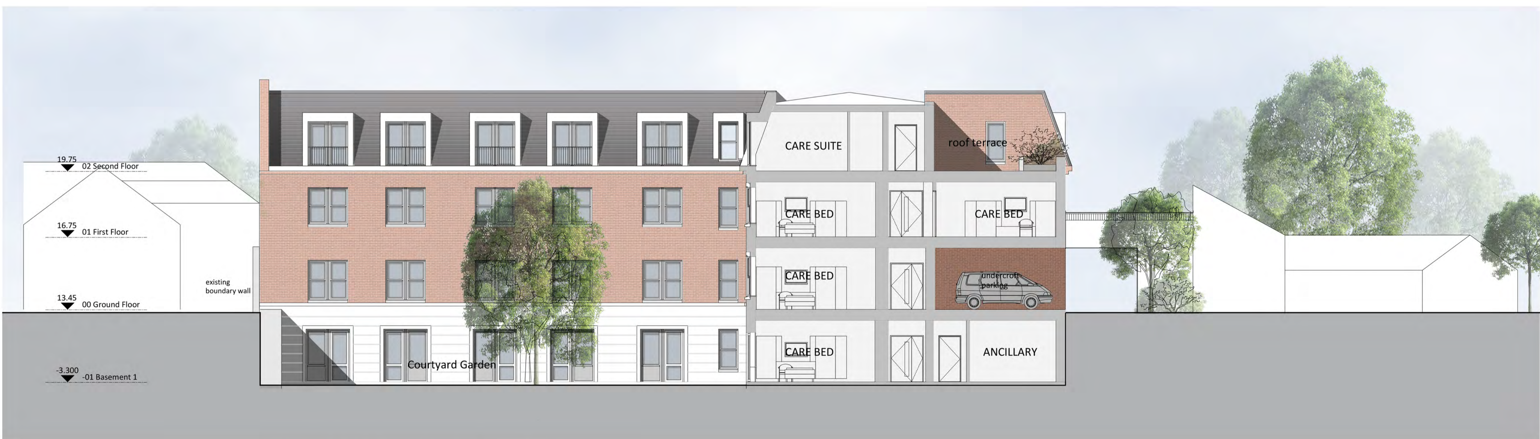
Section C-C - South Elevation through Courtyard Garden I:100