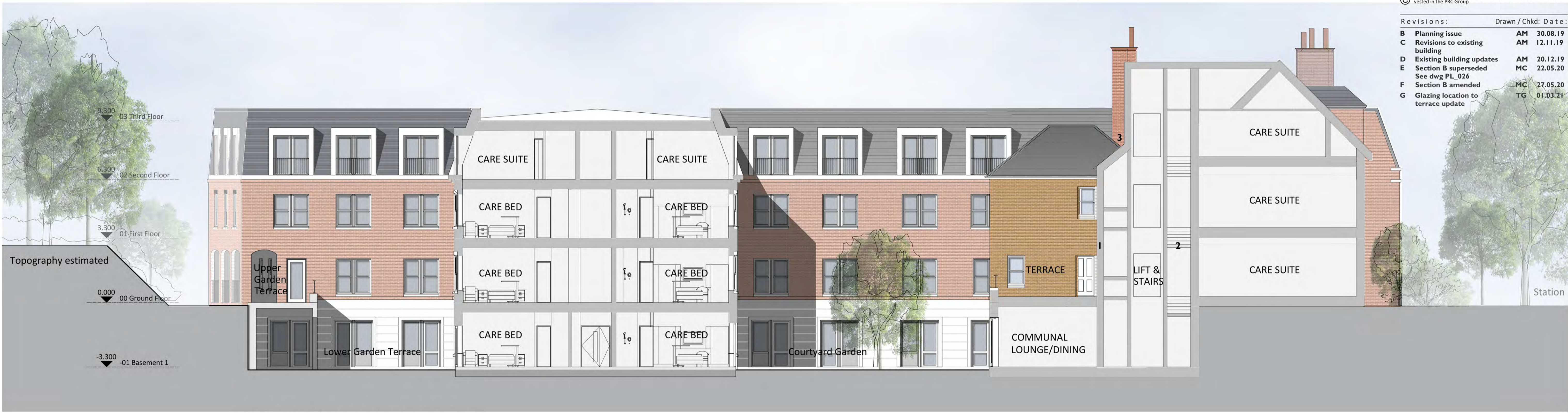
Section B-B - West Elevation / Site Cross Section I:100