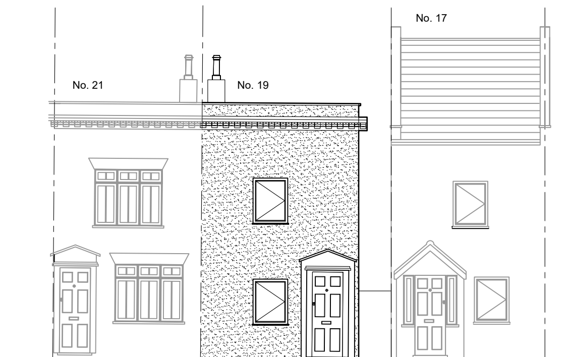
Existing Front Elevation 1:100