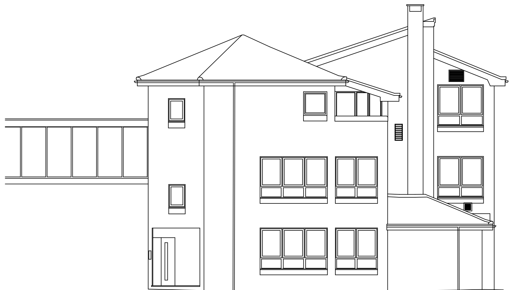
3 BLOCK B: EXISTING - NORTH WEST ELEVATION 1:100