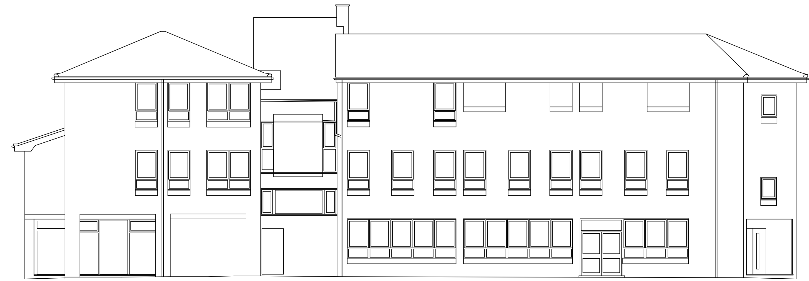
1 BLOCK B: EXISTING - NORTH EAST ELEVATION 1:100