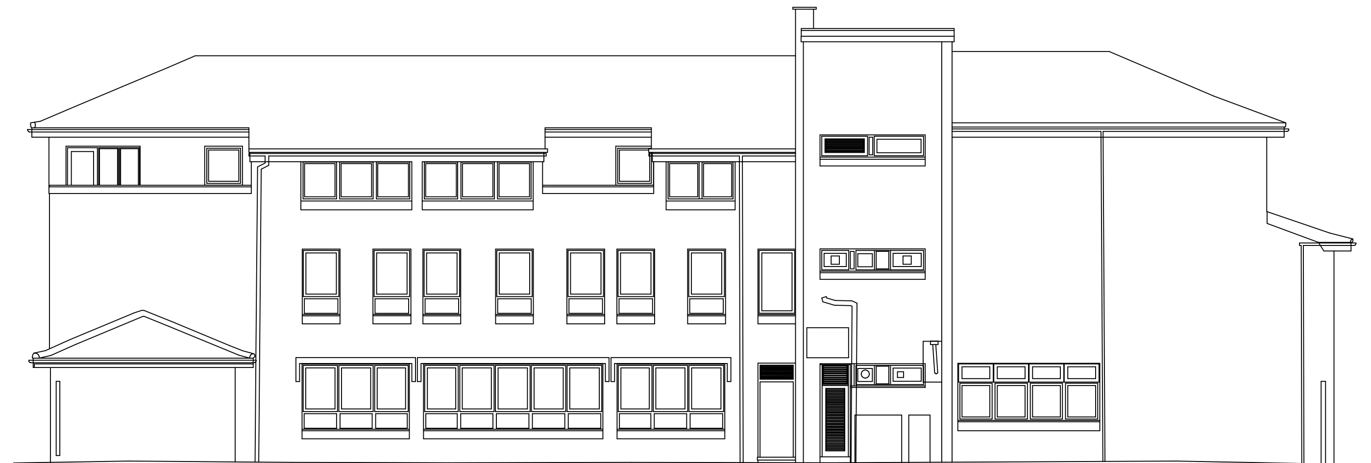
4 BLOCK B: EXISTING - SOUTH WEST ELEVATION 1:100