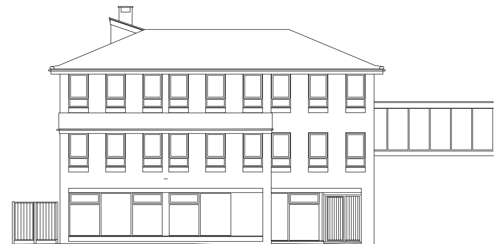
2 BLOCK B: EXISTING - SOUTH EAST ELEVATION 1:100