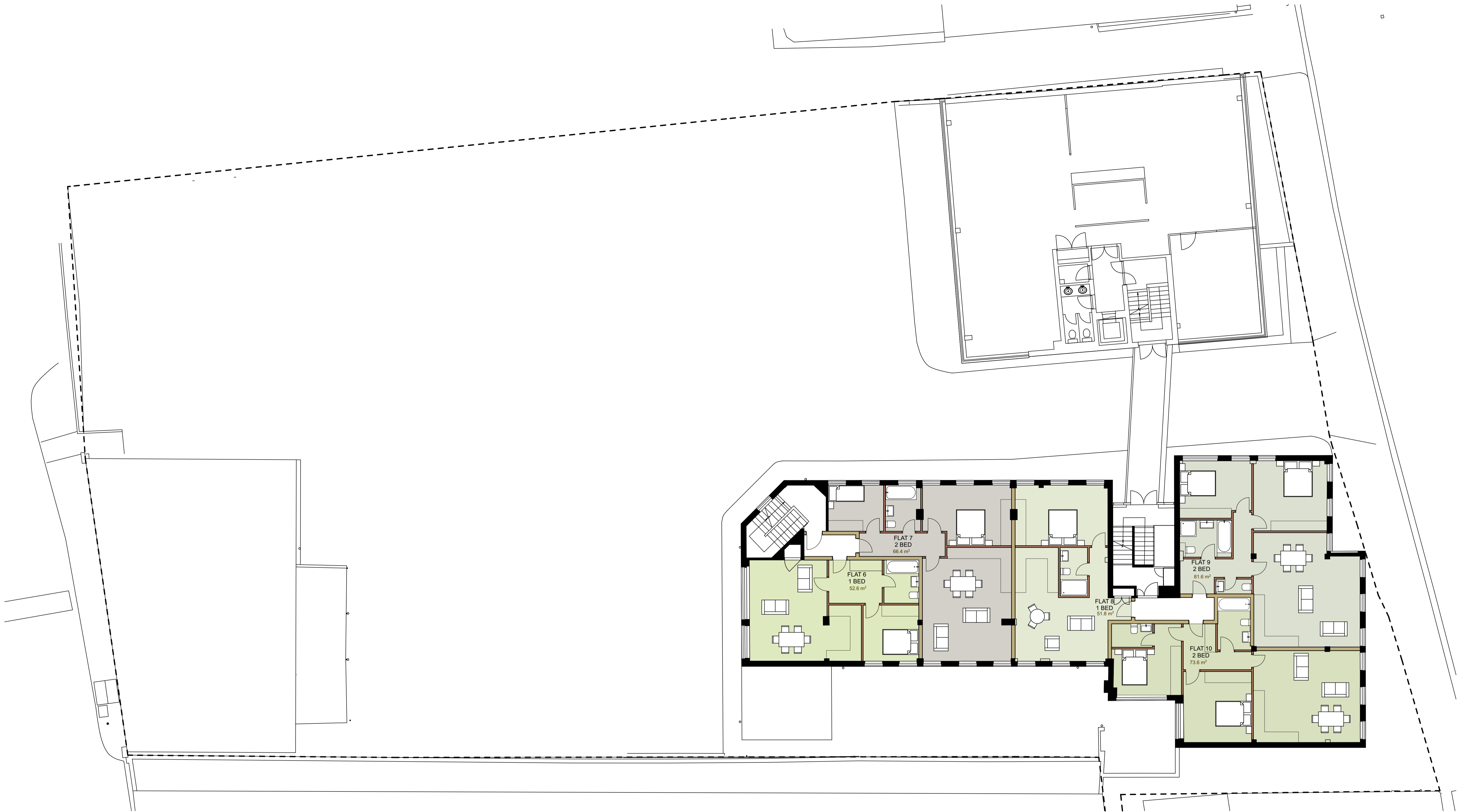
PROPOSED - FIRST FLOOR