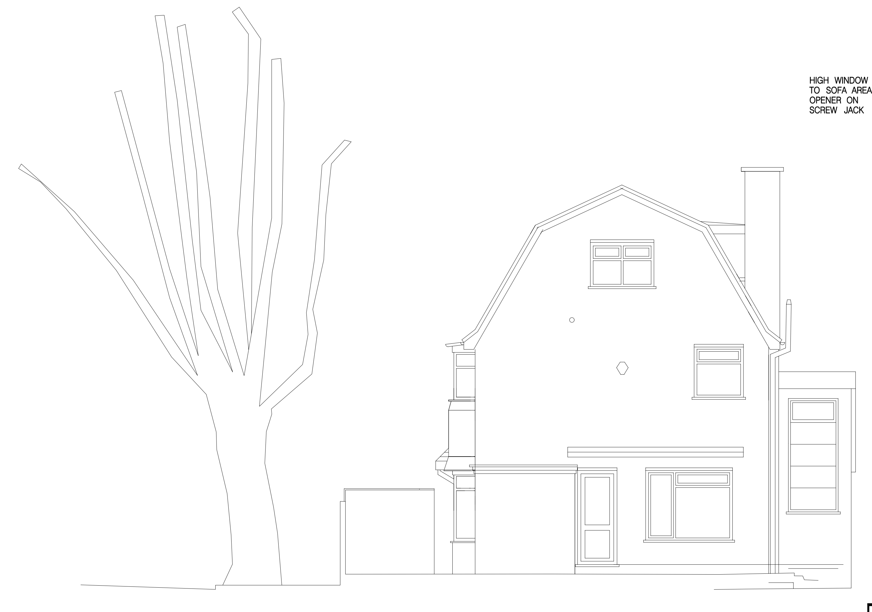
PROPOSED WEST ELEVATION Datum: 5.00m.