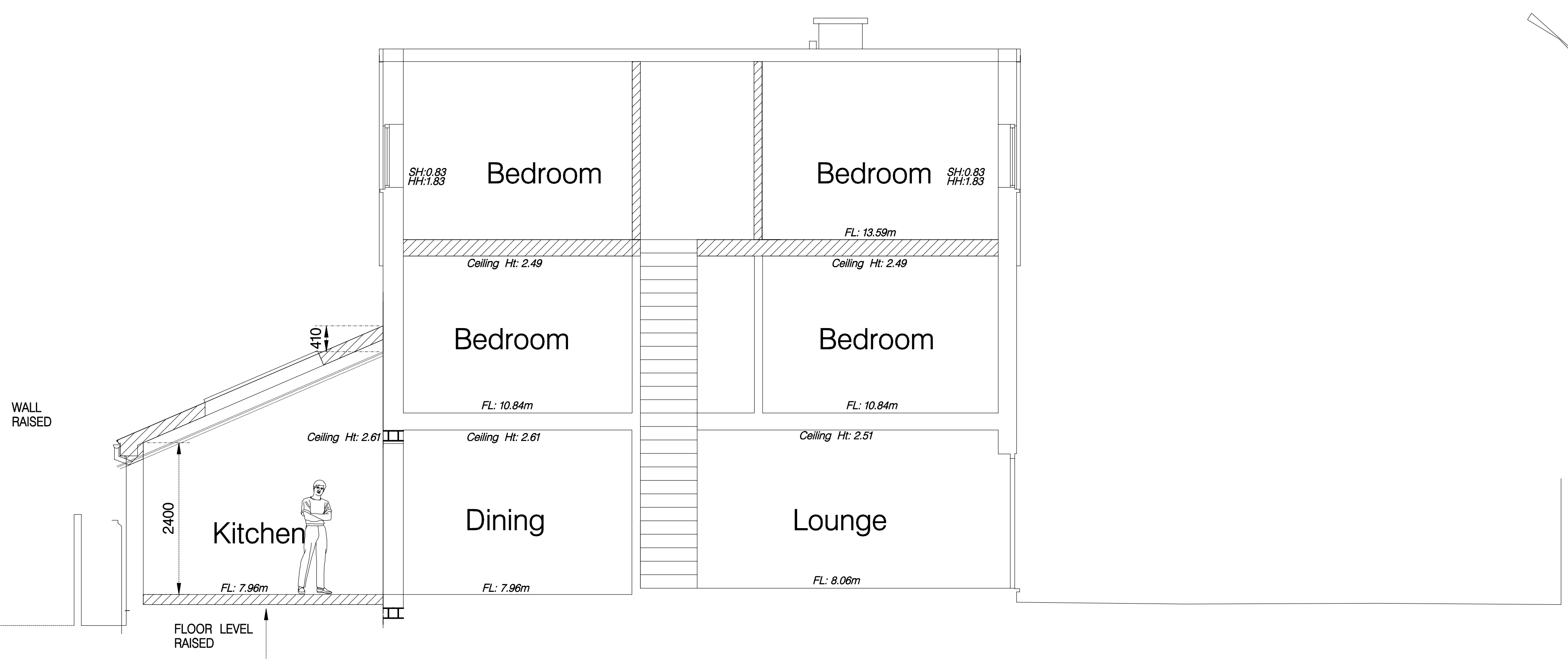
PROPOSED EAST – WEST SECTION Datum: 5.00m.