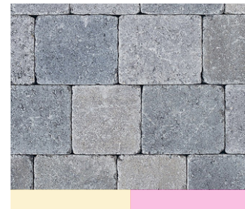
High quality concrete block paving (two tones)