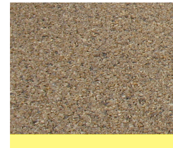
Resin bound gravel