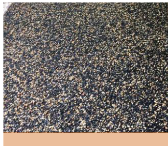
Rubber play surface (existing)