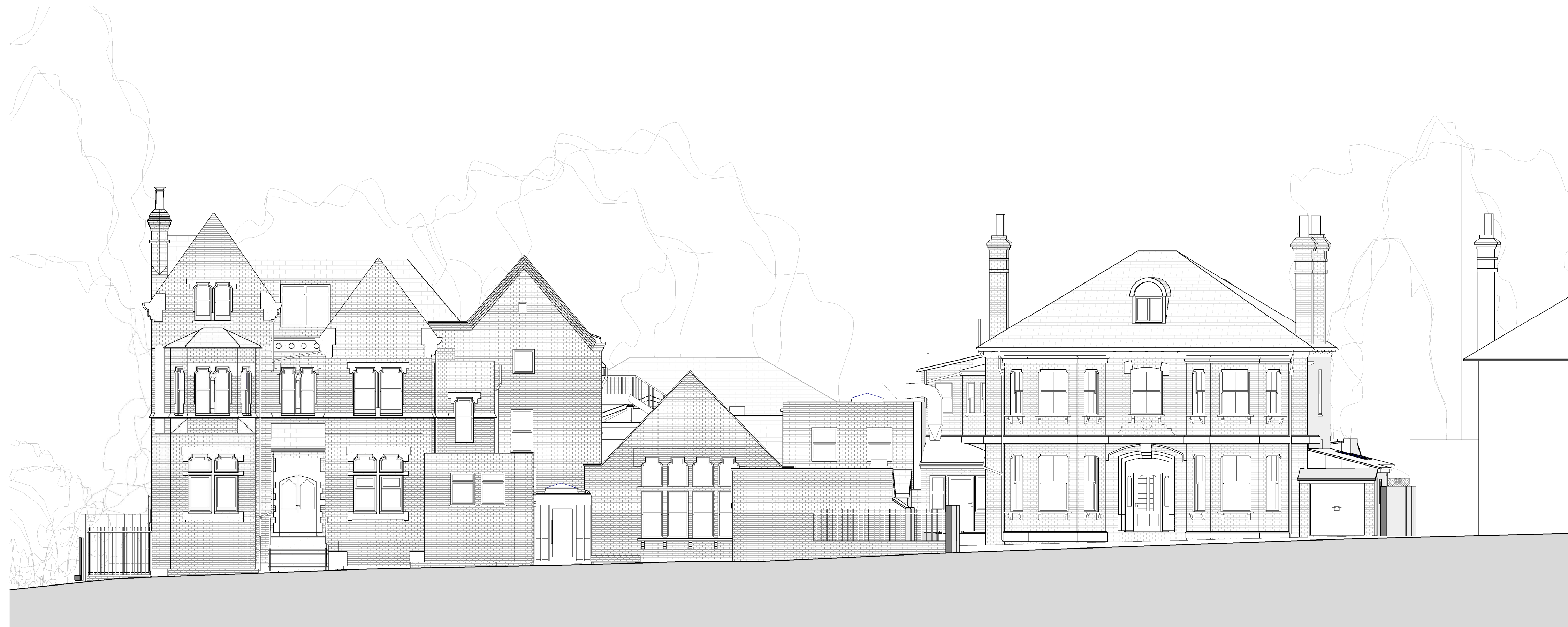
1 EXISTING - STREET ELEVATION 1 : 100