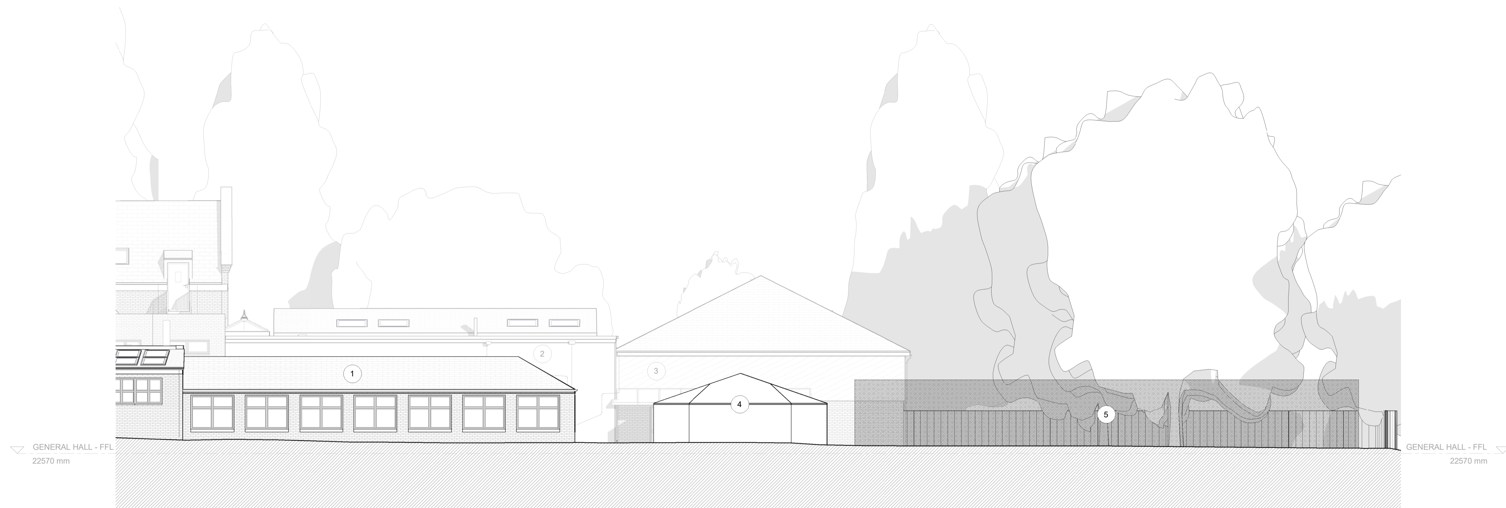
1 EXISTING - SECTION - NEW BLOCK - CLASSROOMS 1:100