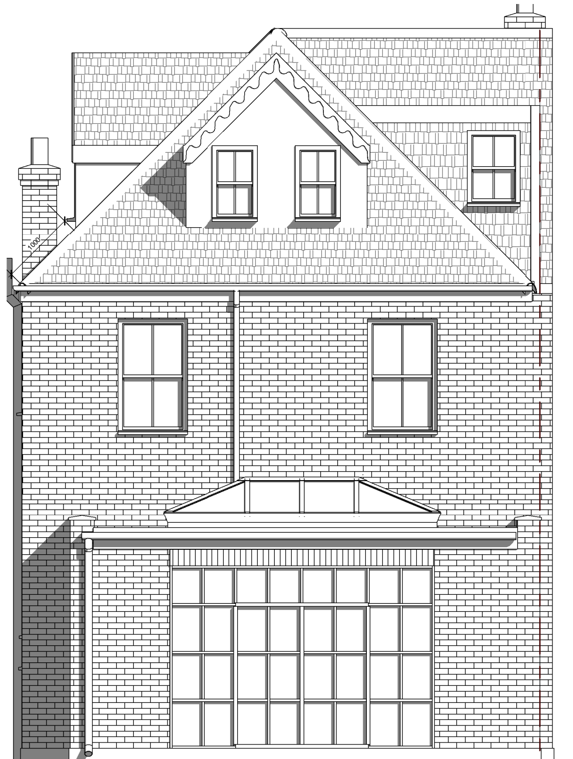
2 PROPOSED REAR ELEVATION 1 : 50