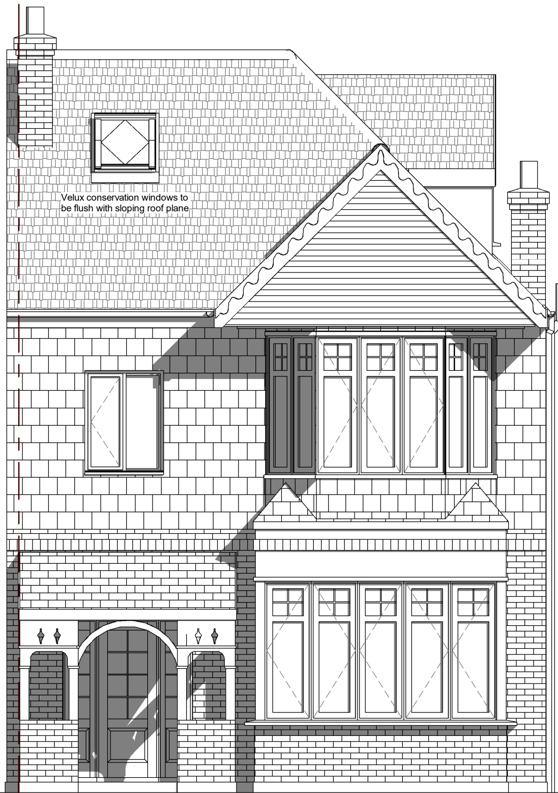
1 PROPOSED FRONT ELEVATION 1 : 50