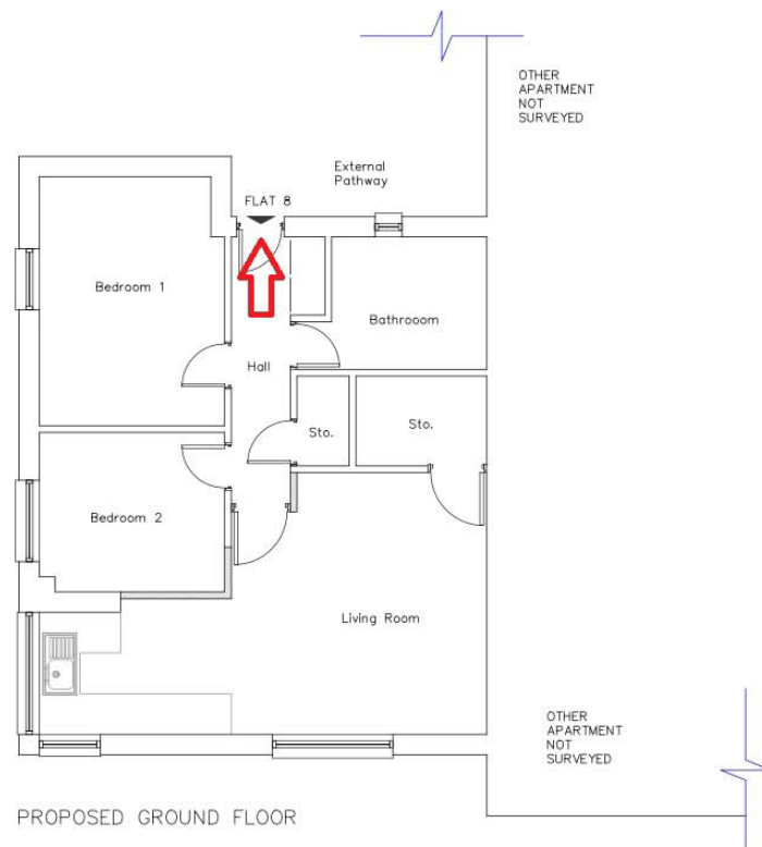
b) Proposed ground floor with indicated fire escape

Once the balcony area is added to the existing apartment, the fire escape strategy is still to b) discharge the inhabitants via the front door into the secure outdoor area c) separate the new kitchen and living room from the rest of the apartment via a fire rated door.