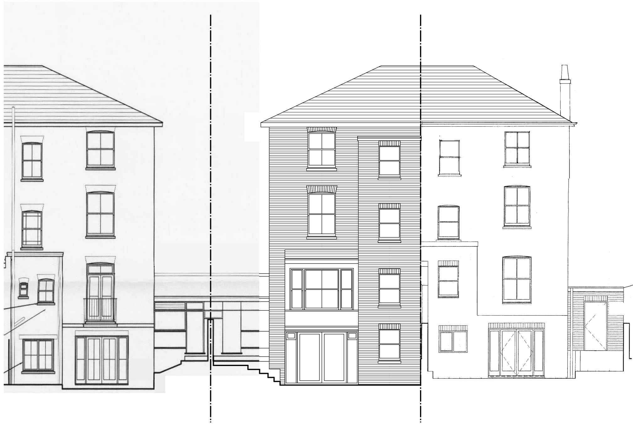
58 The Vineyard