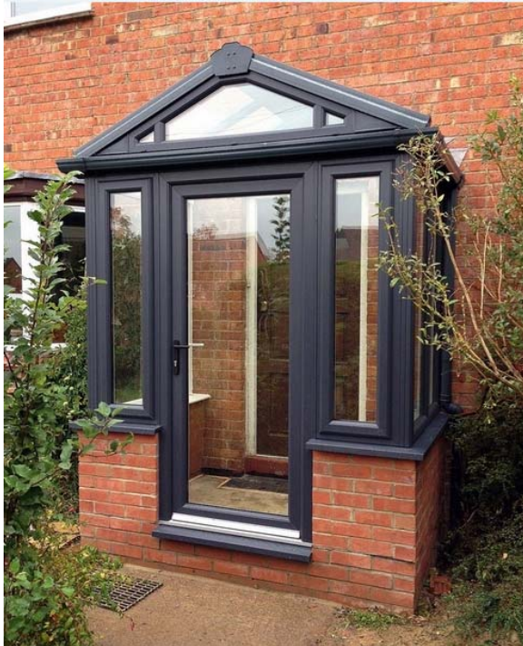
Porch design concept (not dimensioned)

The porch will be constructed with part-bricked walls using engineered brick stock substantially to match the existing frontal brickwork of the house. Double glazed windows and the porch external door will all have aluminium frames in a dark grey anodised finish. The sloping roof will be finished in concrete tiles.