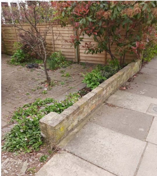
Existing Front Wall